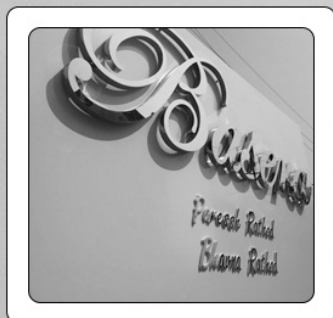
3D Box Type Signage