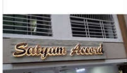
3D Light Box Signage