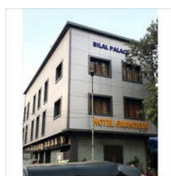
ACP Exterior Cladding