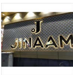
3D LOGO SIGNAGE