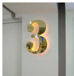
3D Numeric Letter Signage