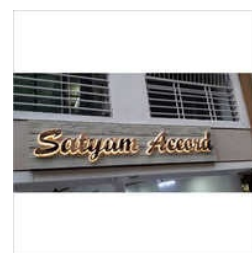
3D LIGHT BOX SIGNAGE