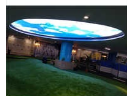
Hotels Stretch Fabric Ceiling