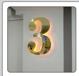
3D Numeric Letter Signage

3D Box Type Signage, 3D LED Acrylic Signage, 3D LED Signage, 3D Light Box Signage, 3D Logo Signage, 3D Numeric Letter Signage, 3D Outdoor LED Signage, ACP Commercial Cladding, ACP Exterior Cladding, ACP Wall Cladding, Bedroom Stretch Fabric Ceiling, Emergency Signage Board, Fabric Signages, Fire Exit Signage, Fire Safety Signage, etc.