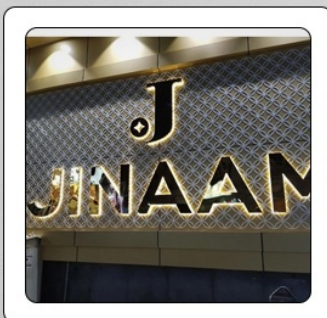
3D Logo Signage