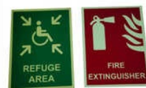
Fire Safety Signage