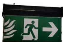
Emergency Signage Board