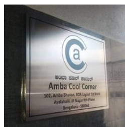
S.S. Etch Name Plates