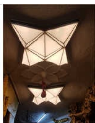
Bedroom Stretch Fabric Ceiling