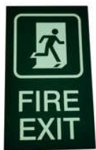
Fire Exit Signage