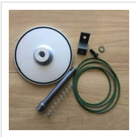
Unloader Valve Kit For Screw Air Compressor