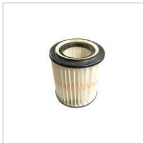
Air Filter For Screw Compressors