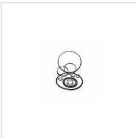
Piston And Rider Rings