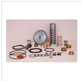
MPV Kits For Screw Air Compressor