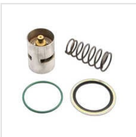
Thermostatic Kits For Screw Air Compressor