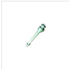
Air Compressor After Cooler