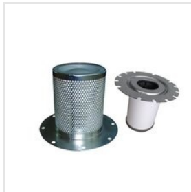
Air Oil Separator For Screw Air Compressor