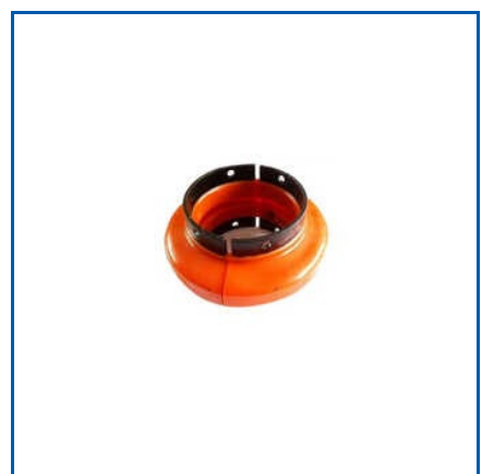
KAESER COMPRESSOR COUPLINGS