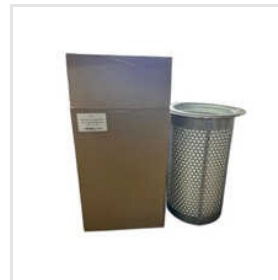
Oil Filter For Screw Air Compressor