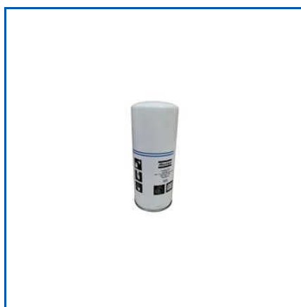
ATLAS COPCO OIL FILTERS