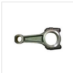
Air Compressor Connecting Rod