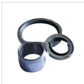
Screw Air Compressors Shaft Seal Kit