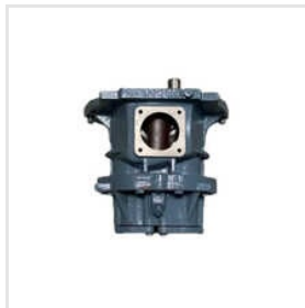
Screw Element Reconditioning