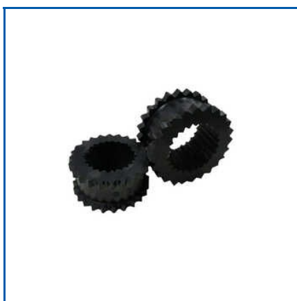
ATLAS COPCO SCREW COMPRESSOR COUPLING

Air Compressor After Cooler, Air Compressor Connecting Rod, Air Compressor Crankshafts, Air Compressor Cross Slide, Air Compressor Cylinder, Air Compressor Inner Head Outer Head, Air Compressor Intercooler, Air Compressor Piston Ring, Air Compressor Tube Bundle For Inter Cooler, Air Compressors Piston Rings, Air Filter For Screw Compressors, Air Oil Separator For Screw Air Compressor, Atlas Copco Compressor Hose Pipe, Atlas Copco Compressors, Atlas Copco Oil Filters, etc.