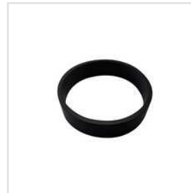
Piston And Rider Rings For Air Compressor