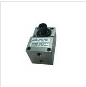
Pressure Sensors For Screw Air Compressor