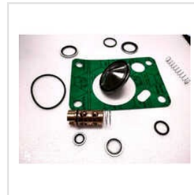
Oil Stop Solenoid Valve For Screw