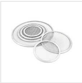
Aluminium Pizza Screen Jointless