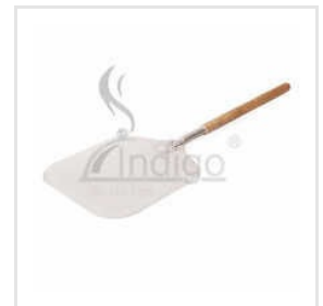
Aluminium Pizza Spade Wooden Handle