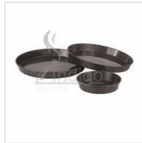
Aluminium Pizza Pan Hard Anodised