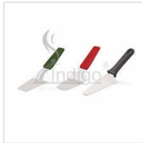
Stainless Steel Pizza Lifter