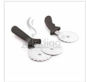
Stainless Steel Pizza Cutter