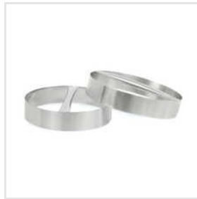
Stainless Steel Dough Cutting Ring