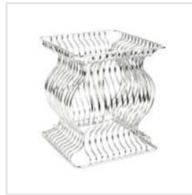
Squar Stainless Steel Riser