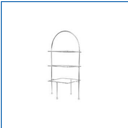
ROUND STAINLESS STEEL PLATES WIRE STAND