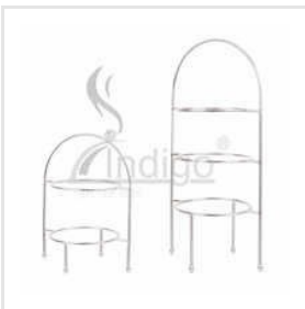
Wire Stand For Plates Round