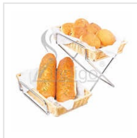
Stainless Steel Buffet Stand With 2 Basket