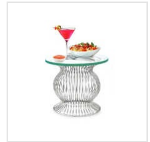
Round Stainless Steel Riser