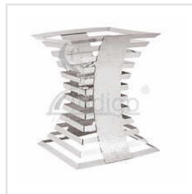
Stainless Steel Riser