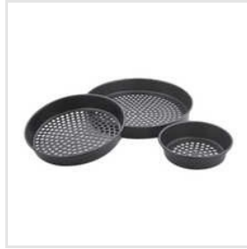
Aluminium Pizza Pan Perforated