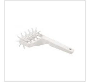
Plastic Pizza Docker