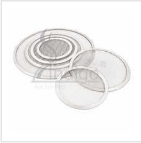
Aluminium Pizza Screen Jointless