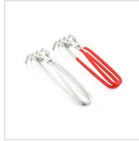
Stainless Steel Wire Pakkad