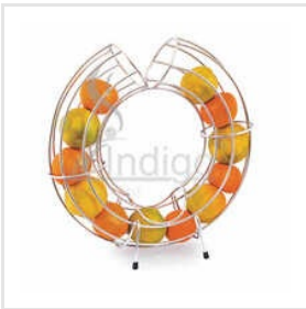
Stainless Steel Fruit Dispenser Stand