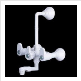
White Plastic Wall Mixer