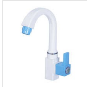
Swan Neck Sink Cock