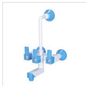
Plastic Wall Mixer