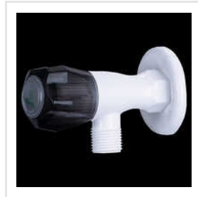
Bathroom Bib Cock