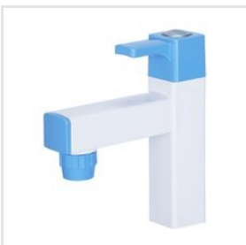
Plastic Pillar Cock