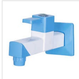
Plastic Bib Cock