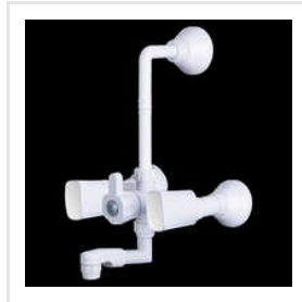
Bathroom Wall Mixer