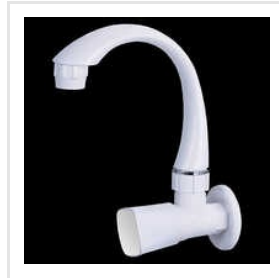
Plastic Sink Cock