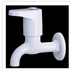
White Long Bib Cock