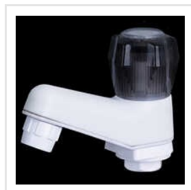
White Small Bib Cock