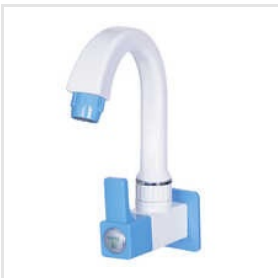
Plastic Sink Cock