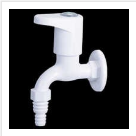
Bathroom Long Bib Cock