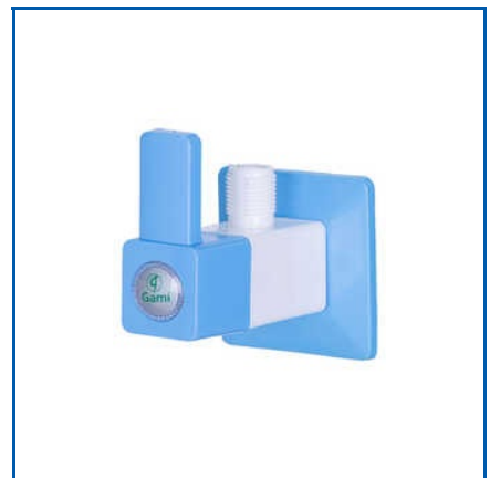
PLASTIC ANGLE COCK