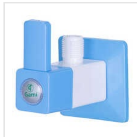
Plastic Angle Cock