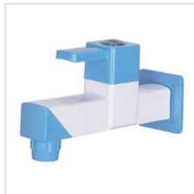
Long Body Bib Cock