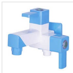
2 In 1 Bib Cock