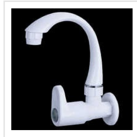
Kitchen Sink Cock