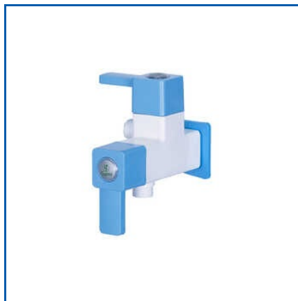
BATHROOM ANGLE COCK