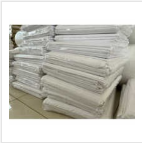
Hotel Stripes Bed Sheet Set