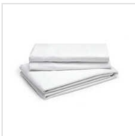
White Bed Sheet Set