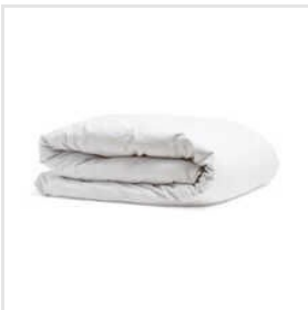
Hotel White Plain Duvet Cover