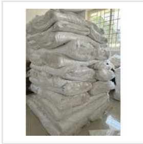
Hotel Bed Sheet Set