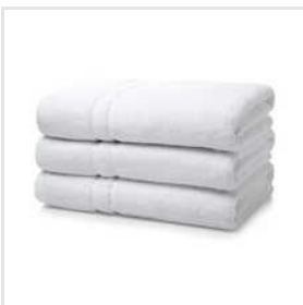
Hotel White Terry Towel