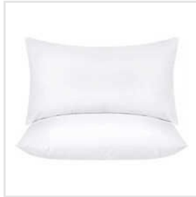
White Pillows For Hotels