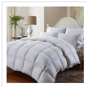
Winter Hotel Quilt With Micro Fibre Filling