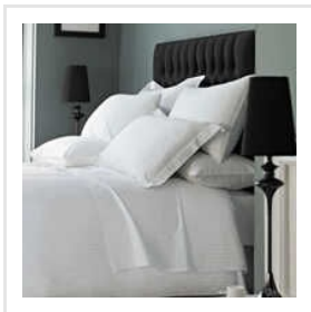
Satin Stripes Hotel Bedding Set