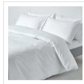
White Cotton Duvet Cover