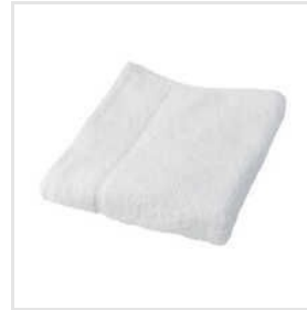
Hotel Bath Towel