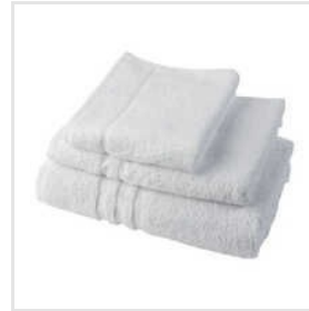
White Hotel Hand Towel