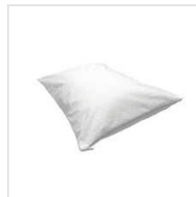
Terry Pillow Protector Zippered