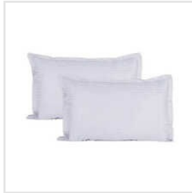
White Cotton Pillow Covers For Hotel