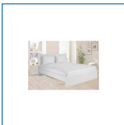
PLAIN WHITE COTTON HOTEL BED SHEET

800 TC Satin Stripe Fabric, Anglo French Textile Cotton Fabric, Baby Comforter, Bleach Cotton Fabric, Bleached Cotton Fabric, Breathable Dustproof And Waterproof Mattress Protector King Size, Cotton Bath Towel, Cotton Muslin Baby Swaddle Blanket Fabric, Cotton Reverse Satin Stripe Fabric, Cotton Satin Stripe Fabric, Cotton Shirting Fabric, Double Bed Quilt, Dyed Cotton Satin Stripe Fabric, Hospital Cotton Bed Sheet, Hospital White Bed Sheet, etc.