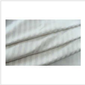
Cotton Reverse Satin Stripe Fabric