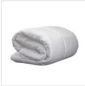
White Hotel Duvet With Micro Fiber Filling