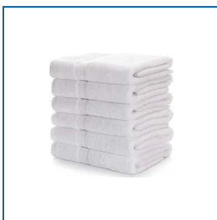
COTTON BATH TOWEL