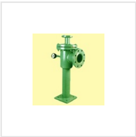
Steam Jet Ejectors