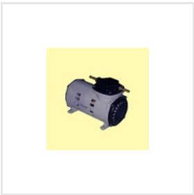
Laboratory Vacuum Pump