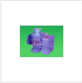
Rotary Vane Vacuum Pumps Dry