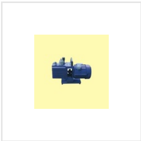
Double Stage High Vacuum Pumps