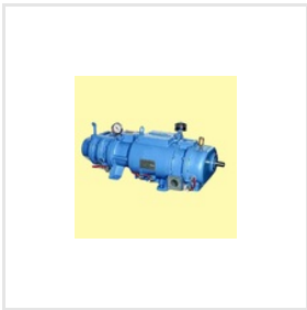
Screw Dry Vacuum Pumps