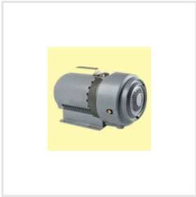
Scroll Dry Vacuum Pumps