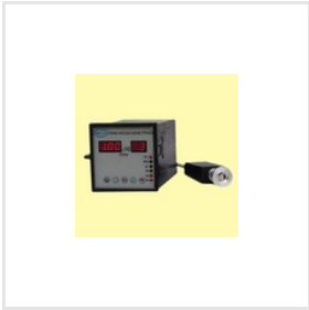
Electronic Penning Gauge