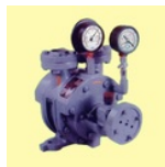
LIQUID RING VACUUM PUMPS SINGLE STAGE