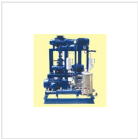
Vacuum Booster Pump System