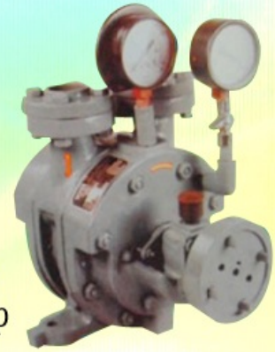
Liquid Ring Vacuum Pump

Claw Dry Vacuum Pumps, Diaphragm Vacuum Pumps, Diffusion Pumps, Diffusion Pump, Double Stage High Vacuum Pumps, Electronic Penning Gauge, Laboratory Vacuum pump, Liquid Ring Vacuum Pump, Liquid Ring Vacuum Pumps Double Stage, Liquid Ring Vacuum Pumps Single Stage, Lobe Dry Vacuum Pumps, Oil Sealed High Vacuum Pump, Once Through Oil Vacuum Pumps, Pirani Gauges, Pressure Blowers, etc.