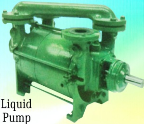
Double Stage Liquid Ring Vacuum Pump