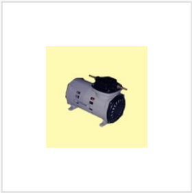
Diaphragm Vacuum Pumps