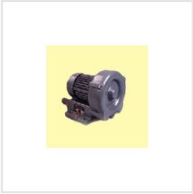
Side Channel Blowers