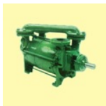
LIQUID RING VACUUM PUMPS DOUBLE STAGE

Claw Dry Vacuum Pumps, Diaphragm Vacuum Pumps, Diffusion Pumps, Diffusion Pump, Double Stage High Vacuum Pumps, Electronic Penning Gauge, Laboratory Vacuum pump, Liquid Ring Vacuum Pump, Liquid Ring Vacuum Pumps Double Stage, Liquid Ring Vacuum Pumps Single Stage, Lobe Dry Vacuum Pumps, Oil Sealed High Vacuum Pump, Once Through Oil Vacuum Pumps, Pirani Gauges, Pressure Blowers, etc.