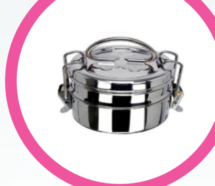
2 Container SS Tiffin Box