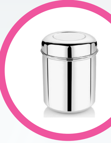
1.6 LTR SS Container