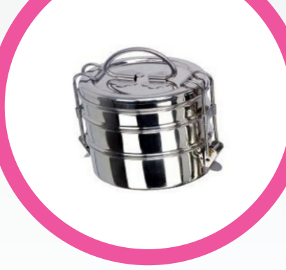
3 Conatiner SS Tiffin Box