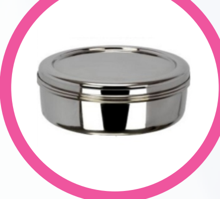
6X9 SS Container