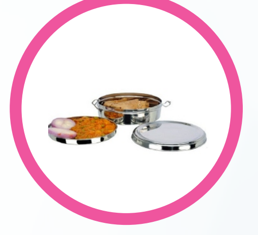
SS Single Container Tiffin Box