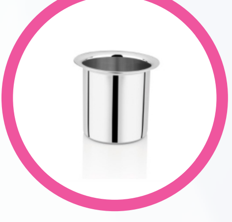
SS Deep Tope