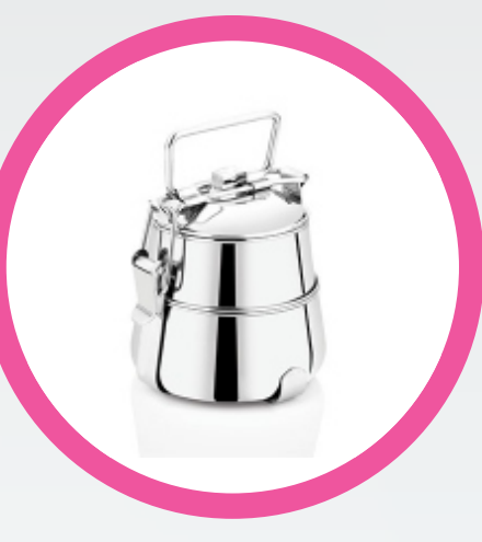
Compact SS Tiffin Box