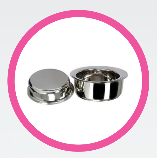
10X18 SS Induction Tope