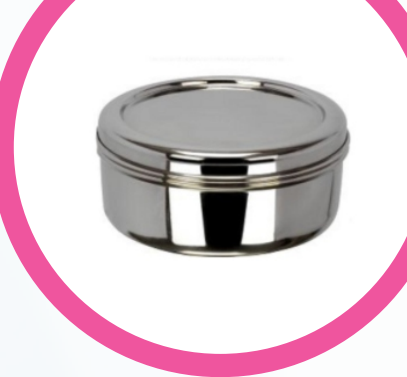
6X9 SS Round Container