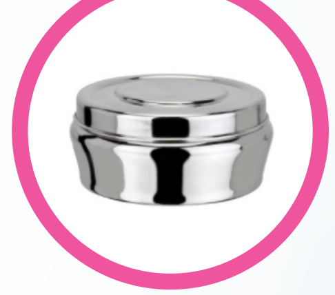
6X9 SS Round Belly Container