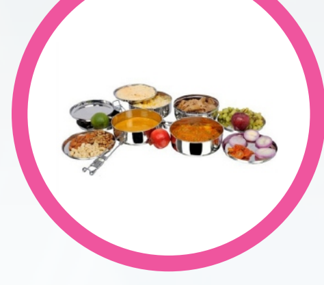
1 LTR 4 Container SS Tiffin Box