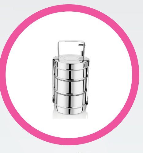
1 LTR SS Tiffin Box