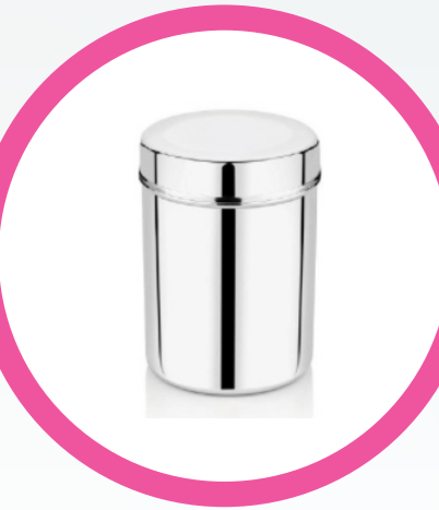
1.2 LTR SS Container