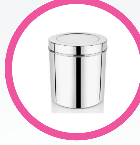
2.3 LTR SS Container