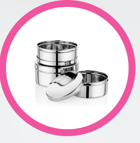
SS Plain Container Set