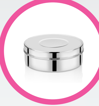
675ML SS Container