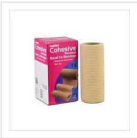
Excel Co Bandage