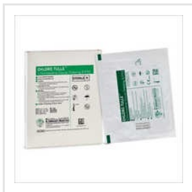
Tulle Gauze Dressing BP