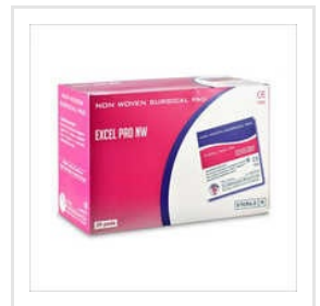
Non Woven Surgical Pad