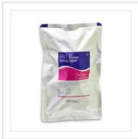
Excel Cast Polyurethane Casting