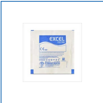
EXCEL EYE PAD

Adhesive Plaster Tape USP, Antiseptic Hexi Wipe, Antiseptic Nuvlon-D Wipe, Belladonna Plaster, Canula Fixing Strip, Capsicum Medical Plaster, Chloro Tulle Dressing BP, Cotton Crepe Bandage, Crepe Bandage, Deep Reach Rheumatic Plaster, Elastic Adhesive Bandage, Elastogrip Bandage, Excel Cast Polyurethane Casting Bandage, Excel Co Bandage, Excel Eye Pad, etc.