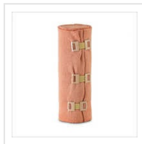
Medical Plast Bandage