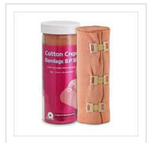
Cotton Crepe Bandage