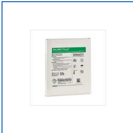
CHLORO TULLE DRESSING BP