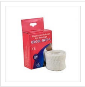
Excel Net-L Bandage