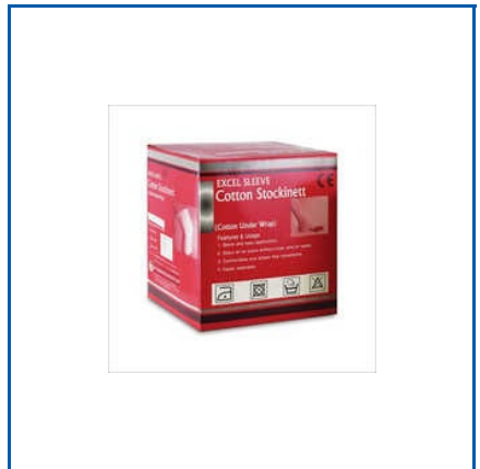
EXCEL SLEEVE COTTON STOCKINETTE