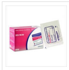
Excel Pad NW Non Woven Surgical Pad