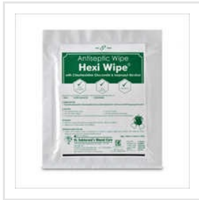
Antiseptic Hexi Wipe