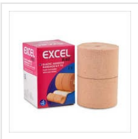
Elastic Adhesive Bandage