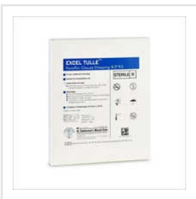
Excel Tulle Bandage