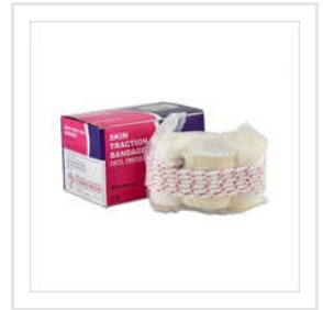
Skin Traction Kit