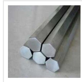
316 Stainless Steel Hex Bar