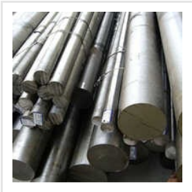
Alloy Steel Cold Rolled Bar