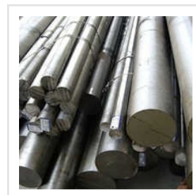
Alloy Steel Cold Rolled Bar