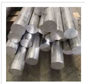
316 L Stainless Steel Round Bar