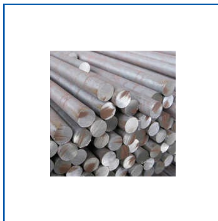
310 STAINLESS STEEL HOT ROLLED BAR