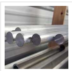
316 Stainless Steel Round Bar