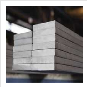
304 Stainless Steel Flat Bar