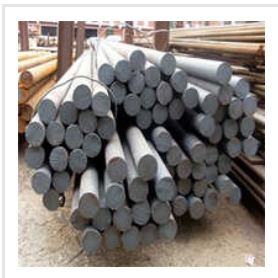
Stainless Steel Cold Rolled Bar