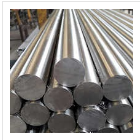
Stainless Steel Bright Round Bar