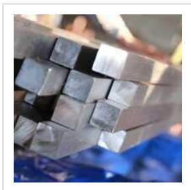
316 Stainless Steel Square Bar