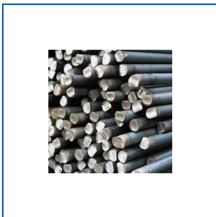
ASTM A36 HOT ROLLED BAR

304 Stainless Steel Flat Bar, 304 Stainless Steel Hex Bar, 304 Stainless Steel Hot Rolled Bar, 304 Stainless Steel Round Bar, 304 Stainless Steel Square Bar, 310 Stainless Steel Flat Bar, 310 Stainless Steel Hex Bar, 310 Stainless Steel Hot Rolled Bar, 316 L Stainless Steel Round Bar, 316 Stainless Steel Flat Bar, 316 Stainless Steel Hex Bar, 316 Stainless Steel Round Bar, 316 Stainless Steel Square Bar, AISI 304 Stainless Steel Triangle Bar, AISI 316 Stainless Steel Triangle Bar, etc.