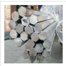
310 Stainless Steel Hex Bar