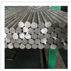
304 Stainless Steel Round Bar