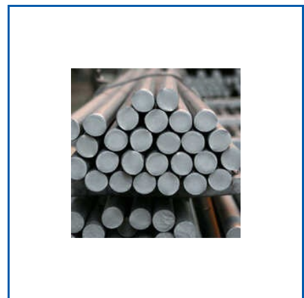
304 STAINLESS STEEL HOT ROLLED BAR