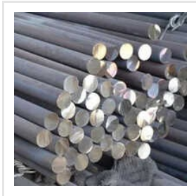
Cold Rolled Bar