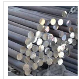
Cold Rolled Round Bar