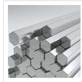
304 Stainless Steel Hex Bar