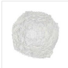
White Cellulose Powder