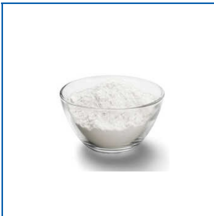
HYDROXYPROPYL METHYL CELLULOSE POWDER

1422 Modified Starch Powder, 1442 Modified Starch Powder, 1450 Modified Starch Powder, Algel A4 Ice Cream Stabiliser Powder, Alginic Acid, Calcium Carboxymethyl Cellulose Powder, Carboxymethyl Cellulose Powder, Croscarmellose Sodium Powder, Guar Gum Powder, Gum Carrageenan Powder, Hydroxyethyl Cellulose Powder, Hydroxypropyl Methyl Cellulose Powder, Locust Bean Gum, Methyl Hydroxyethyl Cellulose Powder, Mhec Powder, etc.