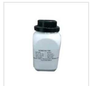
Sodium CMC Powder