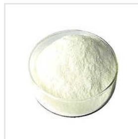
Gum Carrageenan Powder