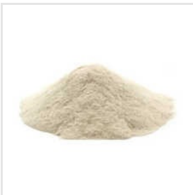
Xanthan Gum Powder