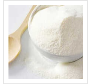
Sodium Alginate Powder