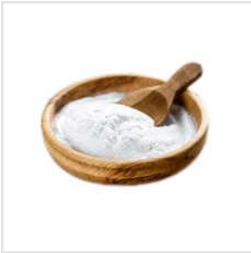
Locust Bean Gum