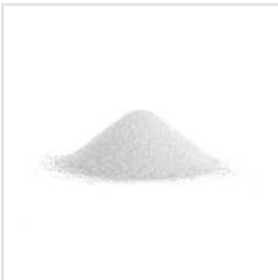
Croscarmellose Sodium Powder