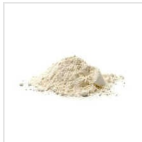
Guar Gum Powder