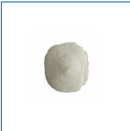
HYDROXYETHYL CELLULOSE POWDER