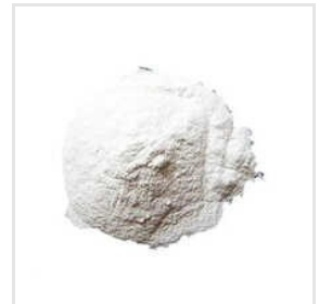
Microcrystalline Cellulose Powder