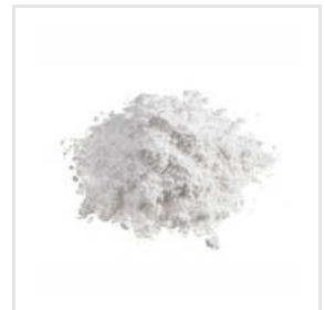
Alginate A4 Ice Cream Stabiliser Powder