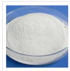
SS900 Gum Alginate Ice Cream Stabilizer