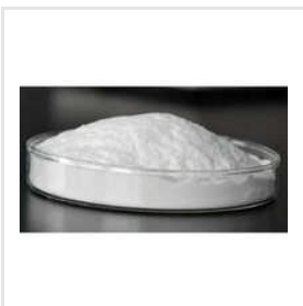
Carboxymethyl Cellulose Powder