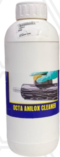
Spotless Cylinder Cleaning Solution