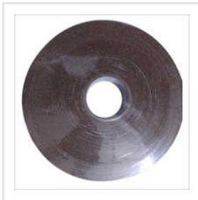
Cork Tape Roll