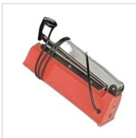
Small Heat Sealing Machine