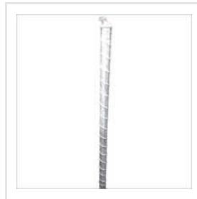
Magnetic Ink Mixing Roller