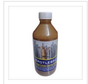
Cylinder Cleaning Solution