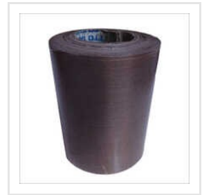
Heat Resistant Nitto Tape