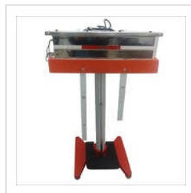
Foot Operator Heat Sealing Machine