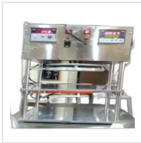
Stainless Steel Pneumatic Heat