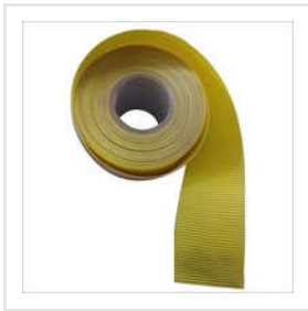
Paper Realising Tape