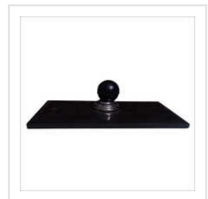
Stainless Steel GSM Template