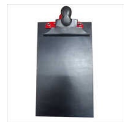
BAR COATER PAD