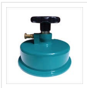
Textile GSM Round Cutter