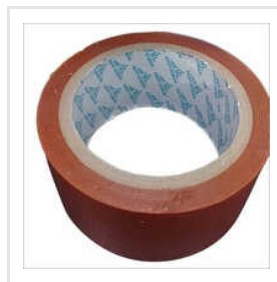
Silicon Adhesive Tape