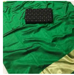
Pleasing Green Sana Silk Golden Zari Border