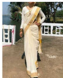
Diva White Chanderi Cotton Light