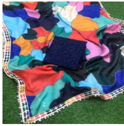
Multi Color Faux Georgette Hand Work