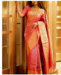
SF Orange Color Kanjivaram Silk Saree