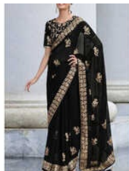
BLACK COLOR PARTYWEAR GEORGETTE SAREE