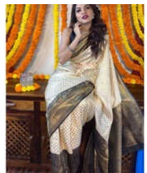
Black Color Soft Lichi Silk Saree