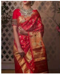
Red Colored Cotton Silk Saree