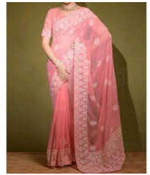
Baby Pink Color Georgette Sequence