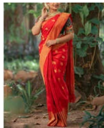
Red Color Soft Lichi Silk Saree