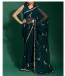
Bottle Green Color Partywear Georgette