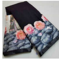
White Colored With Digital Print Faux