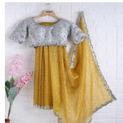
RE Yellow Colored Embroidered Work