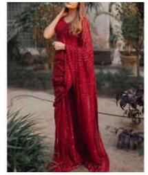
Red Partywear Georgette Sequence