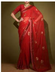
RED COLOR GEORGETTE PRINTED SAREE

Baby Pink Color Georgette Sequence Work Saree, Baby Pink Colored Georgette Anarkali Suit With Net Dupatta, Black And Red Coloured Cotton Embroidery Mirror Work Kurti Set, Black Color Partywear Georgette Saree, Black Color Soft Lichi Silk saree, Black Colored Faux Georgette Embroidery Work Lehenga Choli, Black Colored Georgette Anarkali Suit With Dupatta, Black Rayon Zardoshi Work Kurti Set, Black Thrhread Sequence Georgette Dress, Blue Colored Georgette Anarkali Salwar Suit, Blue Colored Georgette Designer Salwar Suit, Blue Colored Kota Chex Dress Material, Blue Colored Patola Printed Rayon Gown, Blue Rayon Pearl Hand Work Kurti Set, Blue Velvet Sequence Embroidered Work Gown, etc.