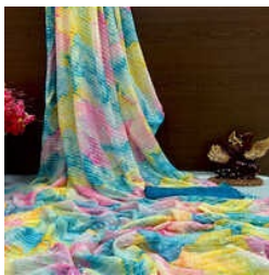
Multi Color Georgette Sequence Work Saree