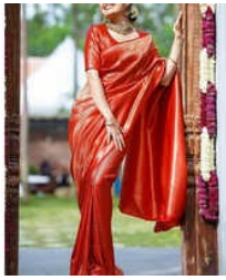
SF Red Color Soft Lichi Silk Saree