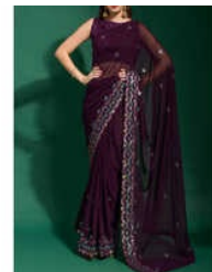
DARK PURPLE COLOR GEORGETTE SEQUENCE WORK DESIGNER SAREE