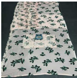
White Colored With Digital Print Faux