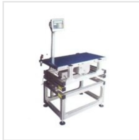
Online Check Weigher