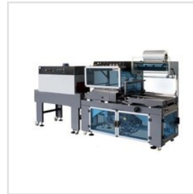
Automatic L Bar Sealer Machine