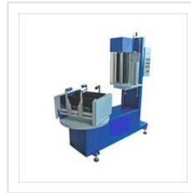
Heavy Reel Stretch Wrapping Machine