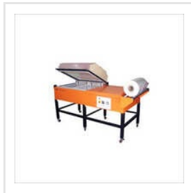
Chamber Shrink Machine