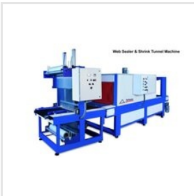
Web Sealer And Shrink Tunnel Machine