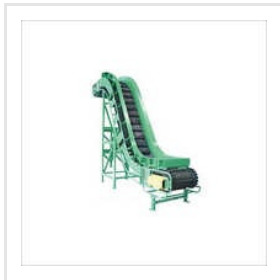
Material Handling Conveyor