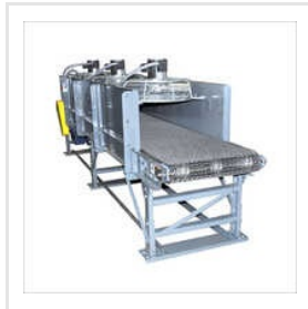
Wiremesh Belt Conveyor