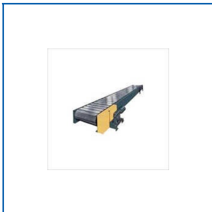
HEAVY DUTY SLAT CHAIN CONVEYOR

90 Radius Modular Conveyor, Automatic L Bar Sealer Machine, Box Stretch Wrapping Machine, Chamber Shrink Machine, Fabric Roll Stretch Wrapping Machine, Heavy Duty Slat Chain Conveyor, Heavy Reel Stretch Wrapping Machine, Inspection Conveyor, Material Handling Conveyor, Online Check Weigher, Pallet Stretch Wrapping Machine, Power Roller Conveyor, Ring Stretch Wrapping Machine, Shrink Tunnel Machine, Web Sealer And Shrink Tunnel Machine, etc.