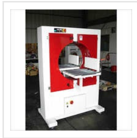
Ring Stretch Wrapping Machine