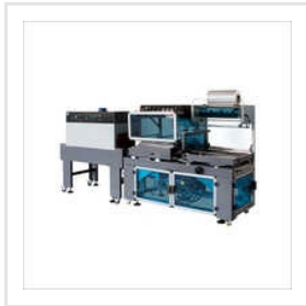
Shrink Tunnel Machine