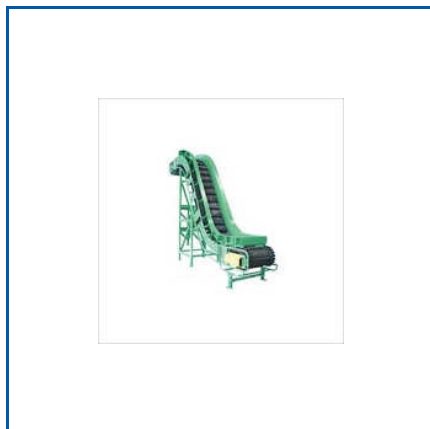
MATERIAL HANDLING CONVEYOR