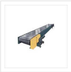
Heavy Duty Slat Chain Conveyor