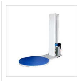
Pallet Stretch Wrapping Machine