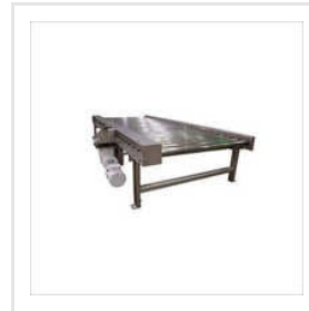
Power Roller Conveyor