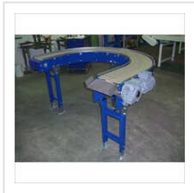
90 Radius Modular Conveyor