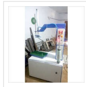
Box Stretch Wrapping Machine