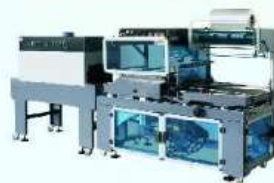
Model:- AP105 ALS AUTO L-BAR SEALER & SHRINK TUNNEL MACHINE