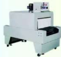
Model:- AP105 ST SHRINK TUNNEL WRAPPING MACHINE