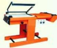
Model:- AP105 LS L-SEALER MACHINE