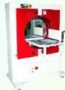
Model:- AP104 IRS RING STRETCH WRAPPING MACHINE