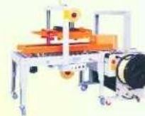
Model:- AP102 CS COMBO AUTOMATIC BOX STRAPPING & CARTON SEALING COMBO