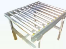
Model :- AP106 R ROLLER CONVEYOR