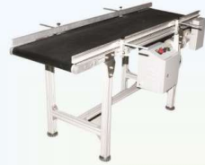
Model:-AP106 B BELT CONVEYOR