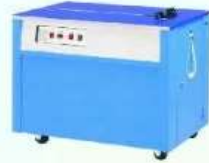
Model:- AP101 SS SEMI AUTOMATIC BOX STRAPPING MACHINE STANDER TYPE