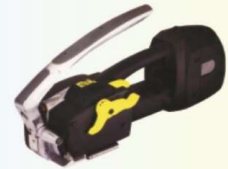
Model:- AP107 HTS HAND TOOLS