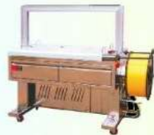
Model:- AP102 AS AUTOMATIC BOX STRAPPING MACHINE