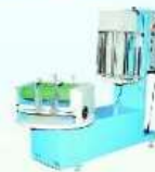
Model:- AP104 RS HEAVY REEL STRETCH WRAPPING MACHINE