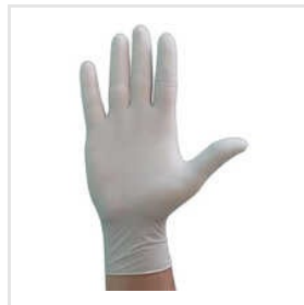
Latex Examination Gloves Powder