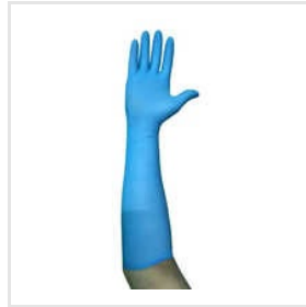
Long Nitrile Gloves