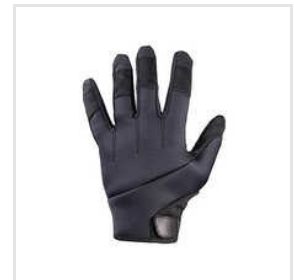
Puncture Protective Glove