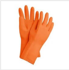
Natrasol Natural Rubber Gloves