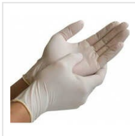
Powder Free Latex Examination Gloves