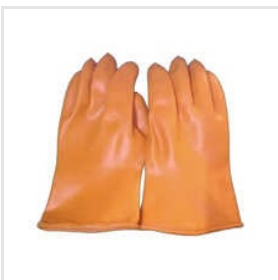
Chemical Resistant Glove