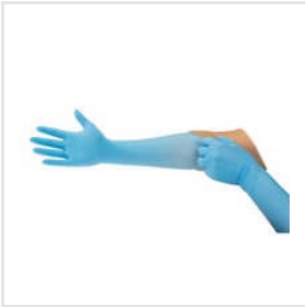
Long Cuff Nitrile Gloves