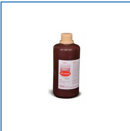
POVIDONE IODINE SOLUTION CIPLADIN