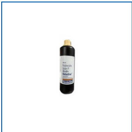
5% POVIDONE IODINE SOLUTION

12 Inch Primus Latex Surgical Powder free Sterile Glove, 200ltr Acetone, 5% Povidone Iodine Solution, Absorbent Gauze Than, Aceclofenac BP, Amoxicillin Trihydrate, Anti Hair Vitalizer Lotion, Anti Static Clean Room Garments With Hood, Anti Static Hood, Anti Static Rubber Booties, Chemical Resistant Glove, Cleanroom Cellulose Wipes, Crepe Bandage, Diclofenac Potassium BP-USP, Diclofenac Sodium IP, etc.