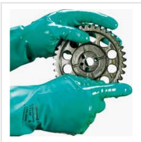
Nitrosol Nitrile Gloves