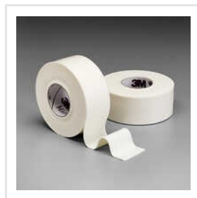
White Surgical Tape