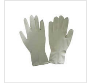
Pharmacare Latex Sterile Surgical Gloves