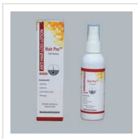
Anti Hair Vitalizer Lotion