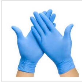
Nitrile Examination Gloves