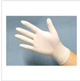
Pharmacare Powder Free Latex Examination