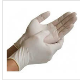
Latex Powder Free Surgical Gloves