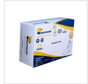
Pharmacare Latex Examination Gloves