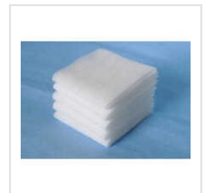
High Quality Gauze Swab