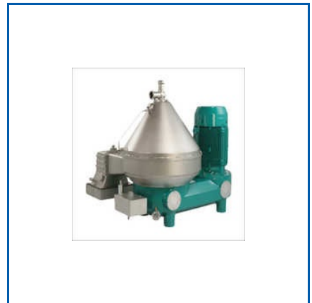
MARINE CENTRIFUGE SEPARATOR