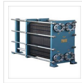
Heat Exchanger Plates