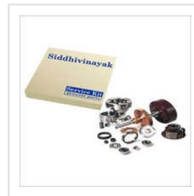
Service Kits For Separators