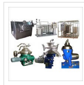
Dairy Equipment Separator