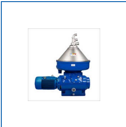
EDIBLE OIL CENTRIFUGE SEPARATOR

Bulk Milk Cooler, Cream Separators, Dairy Equipment, Dairy Farm Separators, Dairy Machine, Dairy Separators, Edible Oil Centrifuge Separator, Electrical Farm Cream Separator, Electronic Cream Separator, Farm Cream Separator, Fish Oil Centrifuge Separator, Food Separators, Ghee Clarifier, Heat Exchanger Plates, Homogenizer Machine, etc.