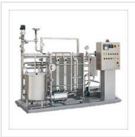
Milk Processing Unit