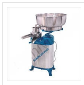
Electrical Farm Cream Separator