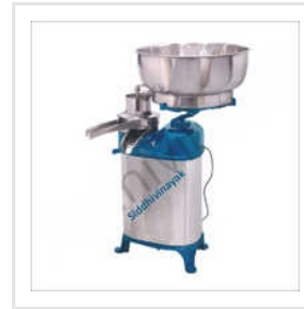
Farm Cream Separator