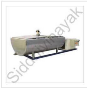
Bulk Milk Cooler