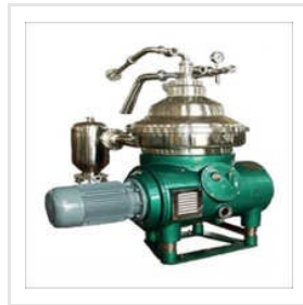
Fish Oil Centrifuge Separator