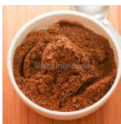
Mutton Masala Powder