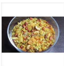
ROASTED POHA CHIVDA NAMKEEN