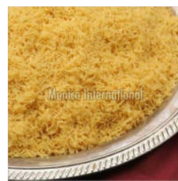
Nylon Sev Namkeen