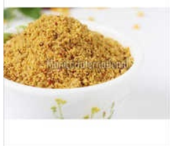
Indian Dosa Podi Masala Powder