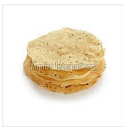
Urad Plain Papad