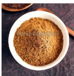
Dosa Podi Masala Powder