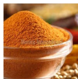
Idli Podi Spice Powder