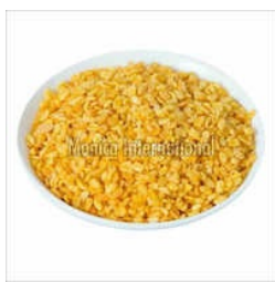
Moong Dal Namkeen