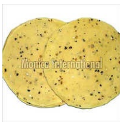
Punjabi Masala Papad