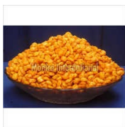
CHANA DAL NAMKEEN

Basmati Rice, Chana Dal Namkeen, Chicken Masala Powder, Dosa Podi Masala Powder, Dried Seedless Tamarind, Dry Bay Leaf, Flattened Rice, Garlic Papad, Idli Podi Spice Powder, Indian Chakki Atta, Indian Dosa Podi Masala Powder, Instant Maggi Masala Noodles, Jeera Papad, Light Yellow Besan Flour, Lime Pickle, etc.