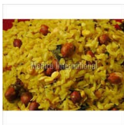
Poha Chivda Namkeen