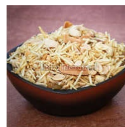
POTATO CHIVDA NAMKEEN