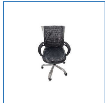
BOOM MESH CHAIR