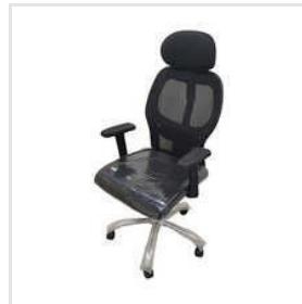
Oscar High Back Twin Seat Chair