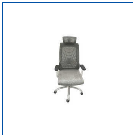
SPIDER HIGH BACK CHAIR