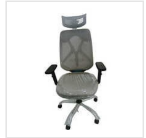
Shipan High Back Chair