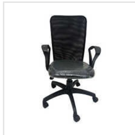
Sigma Low Back Mesh Chair