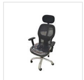
Oscar High Back Chair