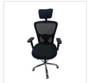
Beatle High Back Chair