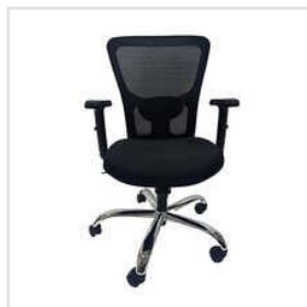
Beatle Medium Back Mesh Chair