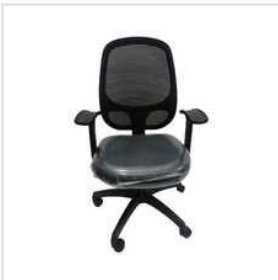
802 Mesh Chair