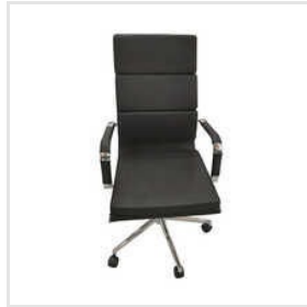
Sleek Triple Cushion Chair