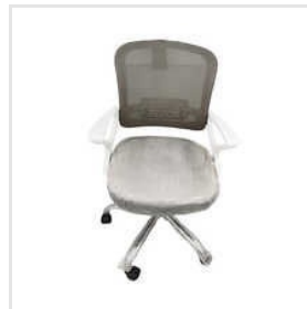
Cherry White Mesh Chair