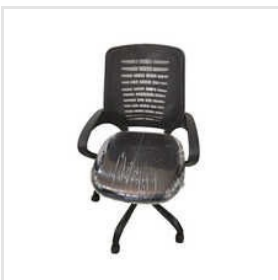
Office Mesh Chair