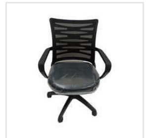
Zigzag Mesh Chair