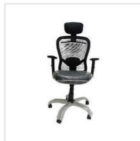
Butterfly High Back Chair