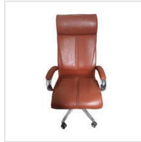
Tan Colour Executive Chair