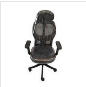
Oscar High Back Matrix Seat Chair