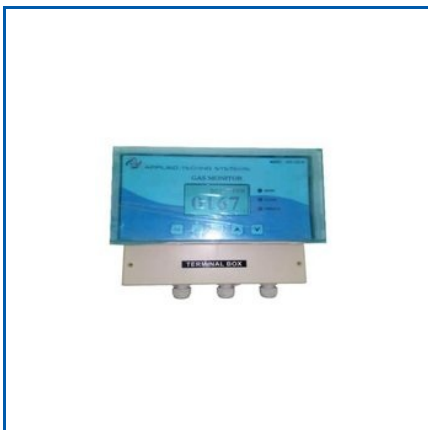
FIXED LPG GAS LEAK DETECTOR

24V DC or 230vac 50 Hz Gas Sensor Transmitter, Air Quality Meter, Air Quality Monitor, Ambient Monitoring Systems, Ammonia Gas Analyser, Ammonia Gas Leak Detector, Ammonia Gas Transmitter, Battery Operated Dew Point Meter, Biogas Analyzer, Broken Bag Detector, CO Gas Detector, CO Gas leak Monitor, CO2 Gas Analyzer, Chlorine Gas Analyser, Chlorine Gas Detector, etc.