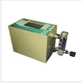
Portable Gas Analyzer