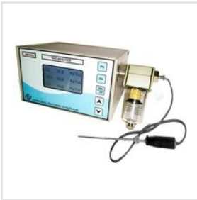
Portable Fuel Efficiency Analyser