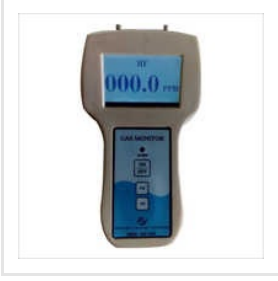
Portable Formaldehyde Gas