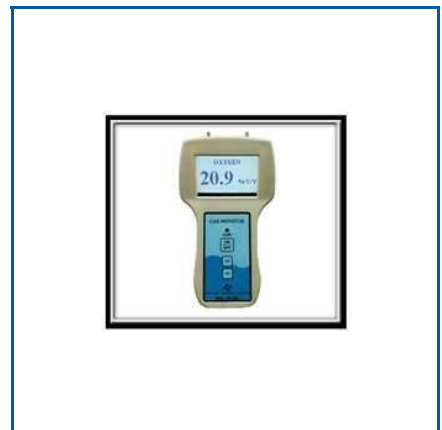
PORTABLE GAS DETECTORS