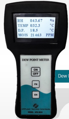
Dew Point Meter

24V DC or 230vac 50 Hz Gas Sensor Transmitter, Air Quality Meter, Air Quality Monitor, Ambient Monitoring Systems, Ammonia Gas Analyser, Ammonia Gas Leak Detector, Ammonia Gas Transmitter, Battery Operated Dew Point Meter, Biogas Analyzer, Broken Bag Detector, CO Gas Detector, CO Gas leak Monitor, CO2 Gas Analyzer, Chlorine Gas Analyser, Chlorine Gas Detector, etc.