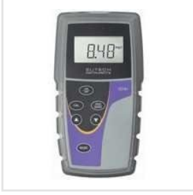
Dissolved Oxygen Meter