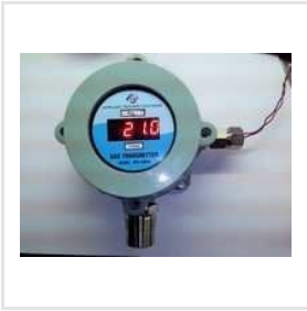
Hydrogen Sensor Transmitter