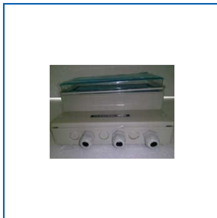
AMMONIA GAS LEAK DETECTOR