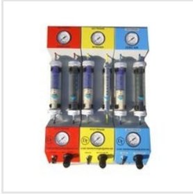
Gas Purification Panel