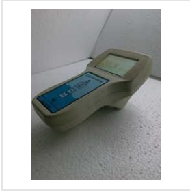
LPG Gas Leak Detector