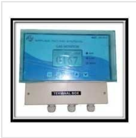
Fixed Gas Detector