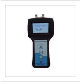
Portable Hydrogen Gas Leak Monitor