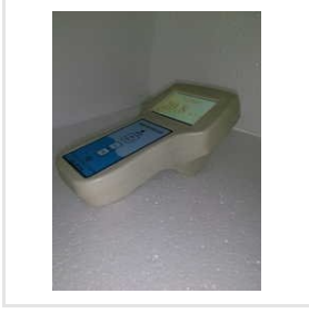
CO Gas Detector