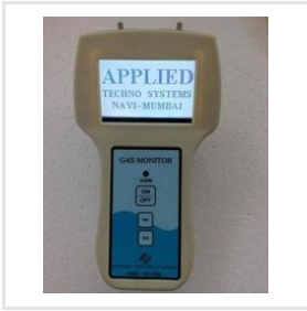
Hydrogen Leak Detector