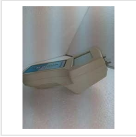
Chlorine Gas Leak Detector