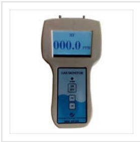
Portable Formaldehyde Gas