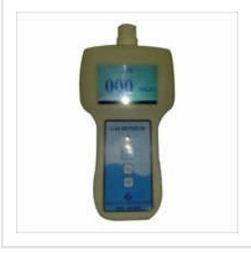
Extech LPG Gas Monitor