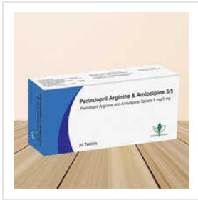
Perindopril Arginine And Amlodipine