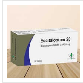
Escitalopram Tablets USP 20 Mg