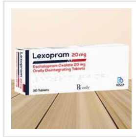
Lexopram Escitalopram Oxalate