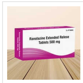
Ranolazine Extended Release Tablets 500 Mg