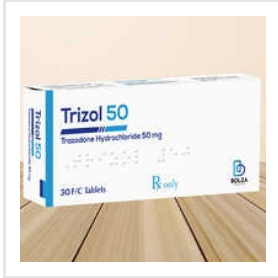
Trizol Trazodone Hydrochloride Tablets