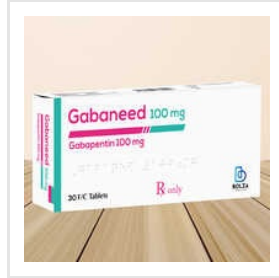
Gabaneed Gabapentin Tablets 100 Mg