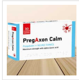
Pregaxon Calm Pregabalin Plus Neuro