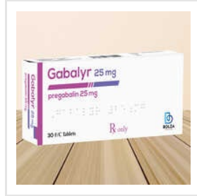
Gabalyr Pregabalin Tablets 25 Mg