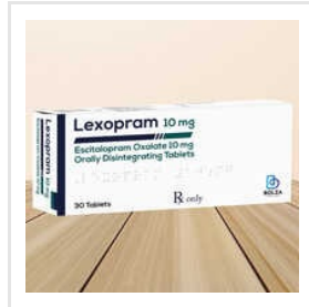
Lexopram Escitalopram Oxalate