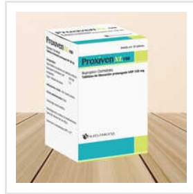
Proxiven XL Bupropion Hydrochlorothiazide