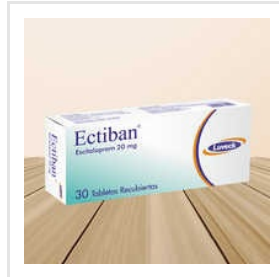
Ectiban Escitalopram Tablets USP 20 Mg