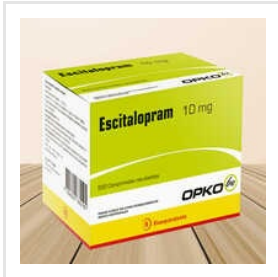
Escitalopram Tablets USP 10 Mg 500 Tablets