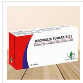
Bisoprolol Fumarate Tablets USP 2.5 Mg 30