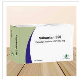
Valsartan Tablets USP 320 Mg