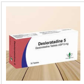
Desloratadine Tablets USP 5 Mg