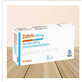
Zoltrin Sertraline Orally Disintegrating Tablets