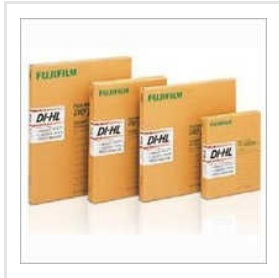
Fuji DIHL X Ray Film