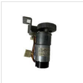
AGFA Drystar 5302 Printer - CAM Drive