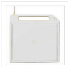
DR Tech X Ray Detector