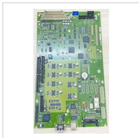
AGFA DRYSTAR 5302 PRINTER DEVIL BOARD