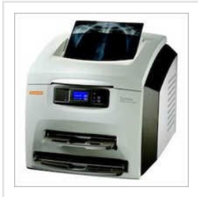
Carestream Dryview Laser Imager