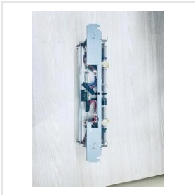
AGFA DRYSTAR 5302 PRINTER OUTPUT