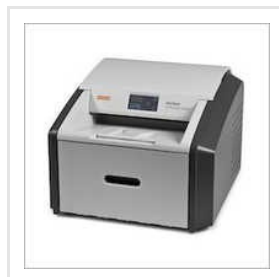
Carestream Dry View 5700 Laser Imager