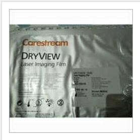
Carestream DVE X Ray Film