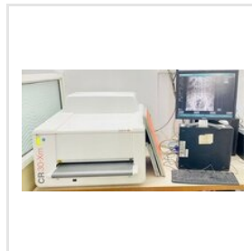
AGFA CR 30XM