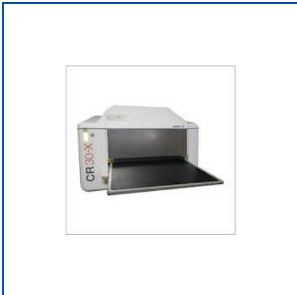
REFURBISHED AGFA CR 30X RADIOGRAPHY SYSTEMS