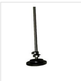
AGFA Drystar 5302 Printer - Cam Drive