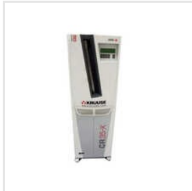
Refurbished AGFA CR- 35 X Machine