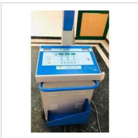
X Ray Machine 200Ma Mobile