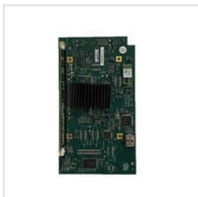
Agfa Drystar 5302 Tyndall PCB Board