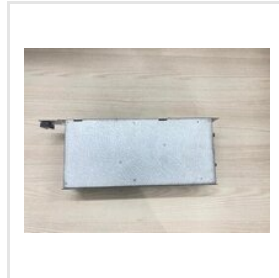
AGFA DRYSTAR 5302 PRINTER POWER SUPPLY