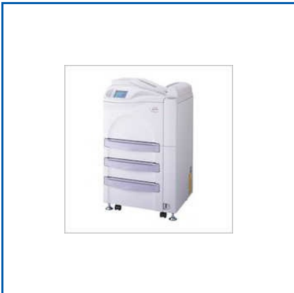
FUJI DRYPIX 7000 DRY LASER IMAGER