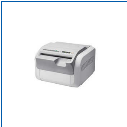
FUJIFILM FCR PRIMA T CR SYSTEM

1.0 General New Agfa Computed Radiography Md, 100 MA Mobile X Ray Machine, AGFA CR 10X-12X-15X Optic Module, AGFA CR 30XM, AGFA CR-10x Refurbished Computed Radiography System, AGFA Computed Radiography 30X Spare Parts, AGFA DRYSTAR 5302 PRINTER DEVIL BOARD, AGFA DRYSTAR 5302 PRINTER OUTPUT MODULE, AGFA DRYSTAR 5302 PRINTER POWER SUPPLY, AGFA DRYSTAR 5302 PRINTER TENDAL BOARD WITH RAM, AGFA DT2B X Ray Film