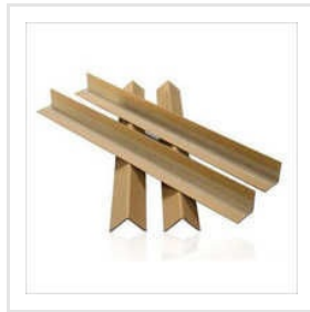
Brown 4mm Paper Angle Board