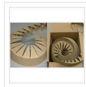
Wrap Round Angle Edge Board