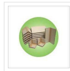
Corrugated Corner Board