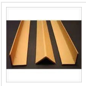
Paper Edge Protector