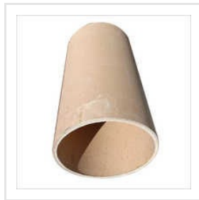
Paper Core Tube Pipe