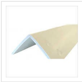
White Paper Angle Board