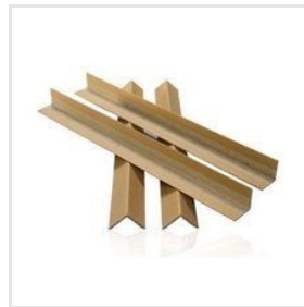
L Shape Angle Boards