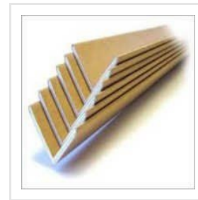
Paper Edge Board