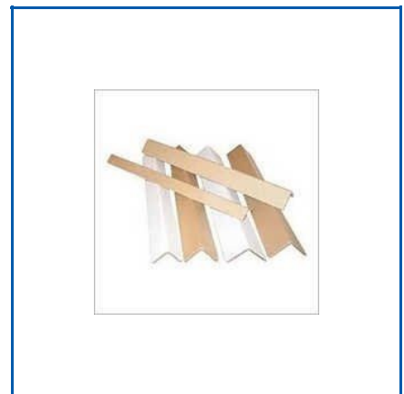
PAPER ANGLE BOARD CORNER