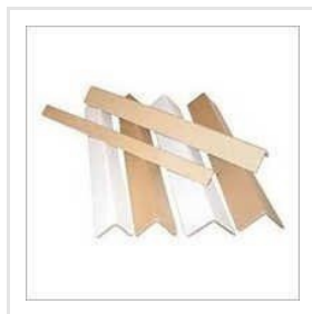
Paper Angle Board Corner