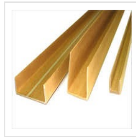
U Shape Angle Board