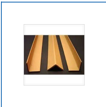
PAPER EDGE PROTECTOR

Brown 4mm Paper Angle Board, Cardboard Angle Board, Corrugated Corner Board, L Shape Angle Boards, Paper Angle Board Corner, Paper Core Tube Pipe, Paper Edge Board, Paper Edge Protector, Plastic Edge Protector, U Shape Angle Board, U Shape Edge Protector, V Shape Angle Board, White Paper Angle Board, Wrap Round Angle Edge Board, etc.