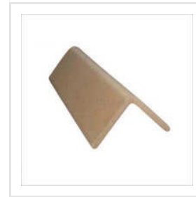
V Shape Angle Board