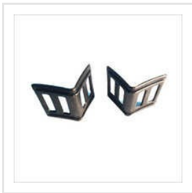
Plastic Edge Protector