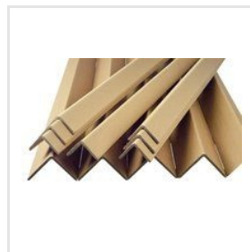
Cardboard Angle Board