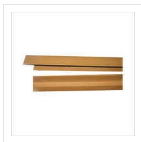
U Shape Edge Protector