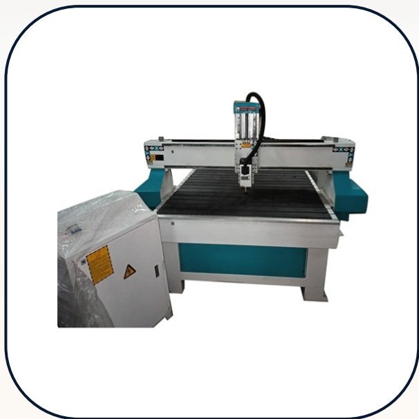
CNC Wood Router Machine