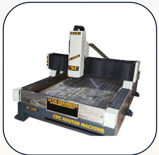
Industrial CNC Router Machine