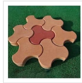
Milano Shape Interlocking Paver