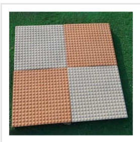
Dots Shape Interlocking Paver