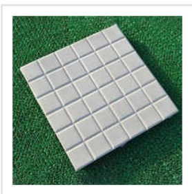
Cadbury Shape Interlocking Paver