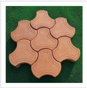
Cosmic Shape Interlocking Paver