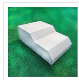
RCC Kerb Stone