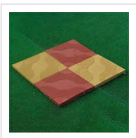
Wave Shape Interlocking Paver