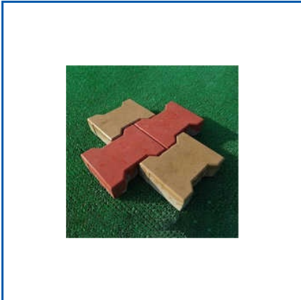
I SHAPE INTERLOCKING PAVER