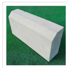
Concrete Kerb Stone