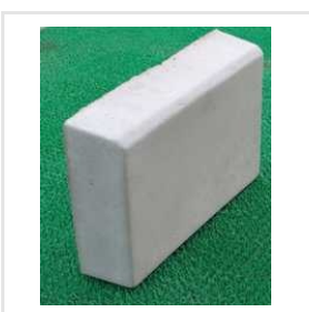
Rectangle Concrete Kerb Stones