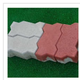
Unipaver Shape Interlocking Paver