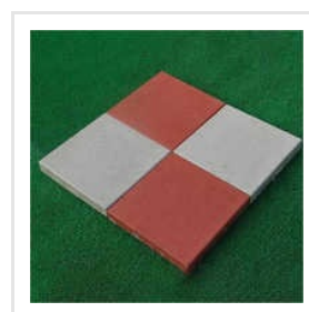
Designer Interlocking Paver