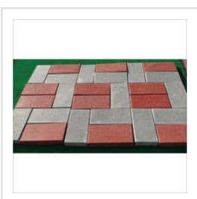
Colorfull Interlocking Paver