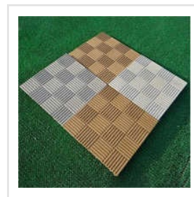
Chess Board Shape Interlocking Paver