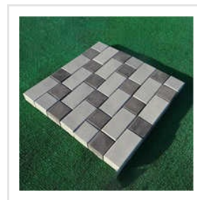
Brick Shape Interlocking Paver