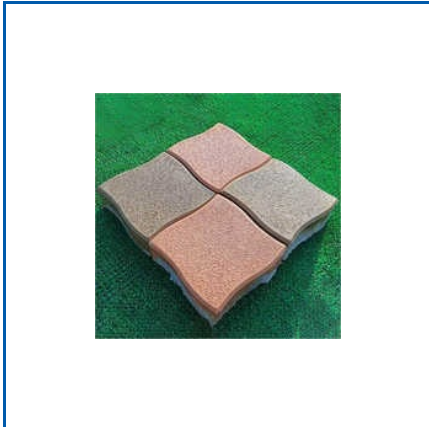
OLGA SHAPE INTERLOCKING PAVER

Arch Interlocking Paver, Brick Interlocking Pavers, Brick Shape Interlocking Paver, Cadbury Shape Interlocking Paver, Cement Brick Interlocking Pavers, Cement Channel, Cement Saucer Drain, Chequered Concrete Tiles, Chess Board Shape Interlocking Paver, Circle Design Interlocking Paver, Circle Shape Interlocking Paver, Circular Design Paver Blocks, Cobblestone Interlocking Pavers, Colorfull Interlocking Paver, ConCrete Kerb Stone, etc.