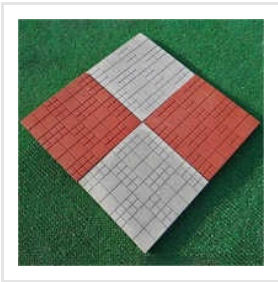
Square Shape Interlocking Paver