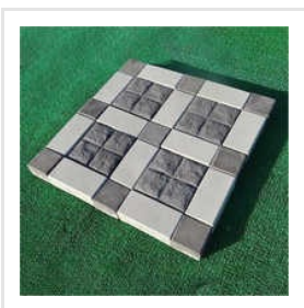
Euro Shape Interlocking Paver