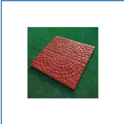
CIRCLE SHAPE INTERLOCKING PAVER