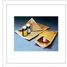
Plastic Bubble Envelopes