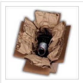
Paper Cushioning Pads