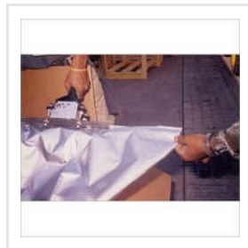
Barrier Locked Bags