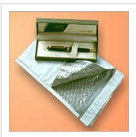
Bubble Packaging Envelopes