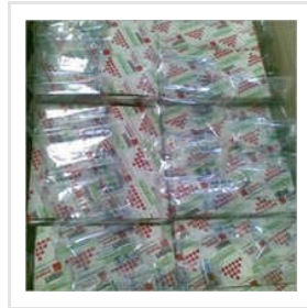
Void Filling Air Bags