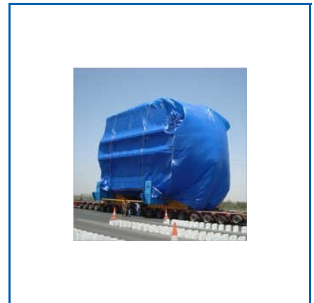
BOILER ON HYDRAULIC TROLLEY EN ROUTE TO JETTY