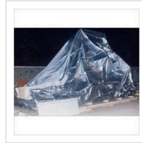
Moisture Barrier Bags