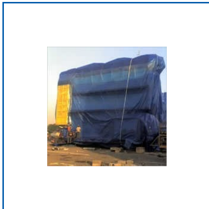
OVERSIZED LOAD JOBS