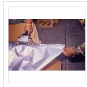
Vacuum Barrier Bags