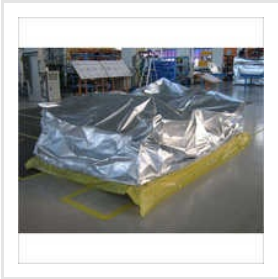
3D Barrier Bags