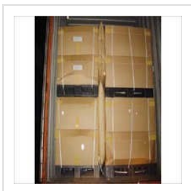
Cargo Dunnage Bags