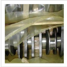
VCI Packaging Film