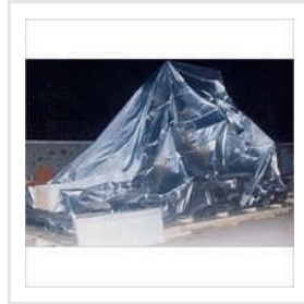
Metal Barrier Bags