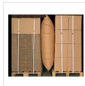
Air Dunnage Bags