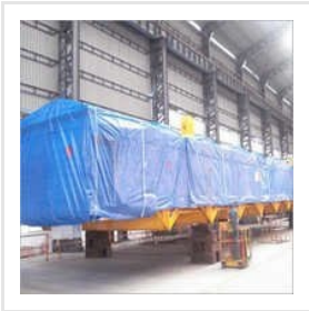
Silpaulin XF Film