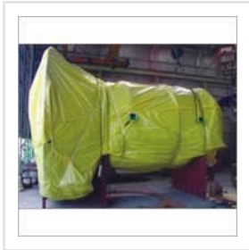
XF Silpaulin Packaging Sheets