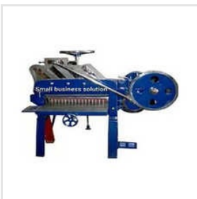
Notebook Making And Cutting Machine (32)