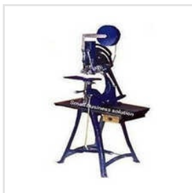
Notebook Making Stitching Machine