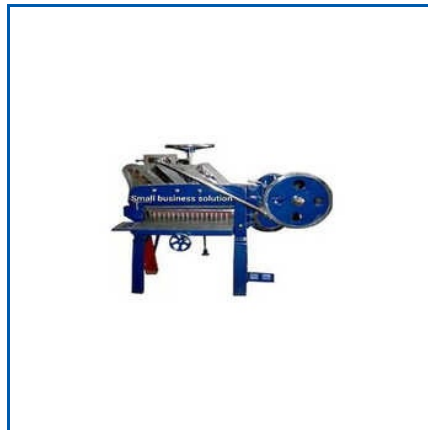
NOTEBOOK MAKING AND CUTTING MACHINE (36 INCH)