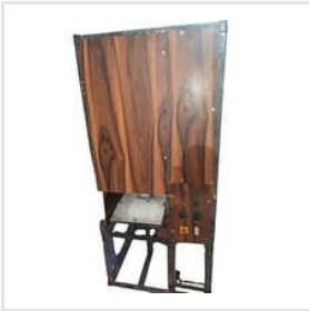
Paper Plate Making Machine Crank (Single)