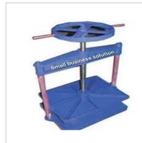
Notebook Making Machine Daab Press