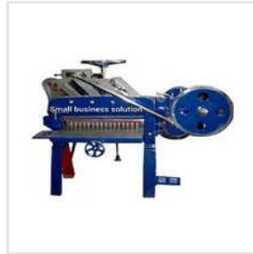
Notebook Making And Cutting Machine 20