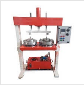
Paper Plate Making Machine Semi-Hydraulic