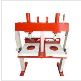
Paper Plate Making Machine Hydraulic