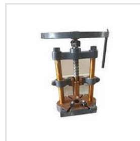
Manual Paper Plate Making Machine