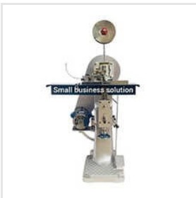
Notebook Making Stitching Machine