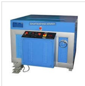
Notebook Making Edge Squaring Machine (51)