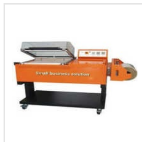
Notebook Making Machine Shrink