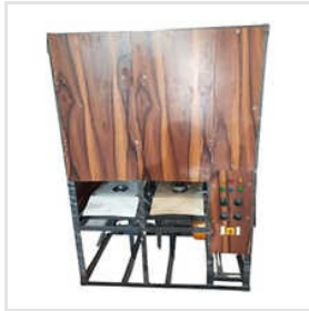
Paper Plate Making Machine Crank