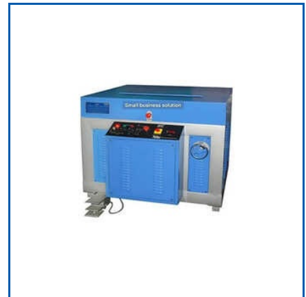
NOTEBOOK MAKING EDGE SQUARING MACHINE (85 CM)