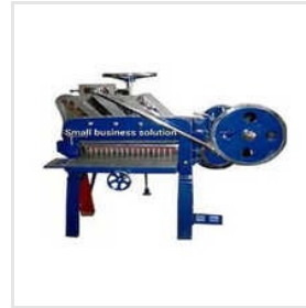
Notebook Making And Cutting Machine (26)