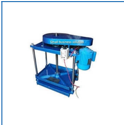
NOTEBOOK MAKING MACHINE DAAB PRESS (MOTORISED)

6 Wire Nails Making Machine, AUTOMATIC SCRUBBER PACKING MACHINE, Agarbatti Making Machine, All In One Non Woven Bag Making Machine, Auto Non Woven Handle Attaching Machine, Automatic High Speed Paper Cutting Machine, Automatic Vacuum Forming Machine, etc.