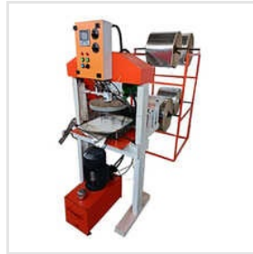
Paper Plate Making Machine Hydraulic