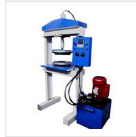
Paper Plate Making Machine Semi-Hydraulic