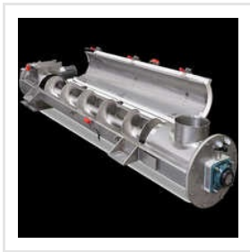
Industrial Screw Conveyors