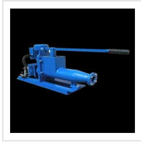
Industrial Pug Mills