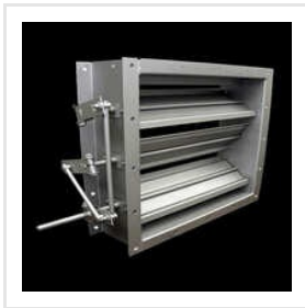
Industrial Steel Dampers