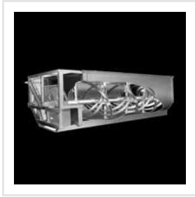
Industrial Ribbon Blenders