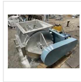
Industrial Rotary Airlock Valves