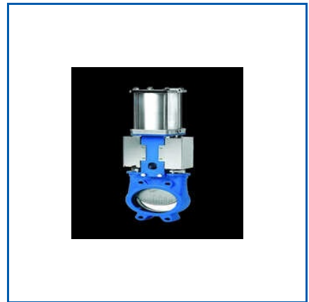
INDUSTRIAL KNIEF GATE VALVES