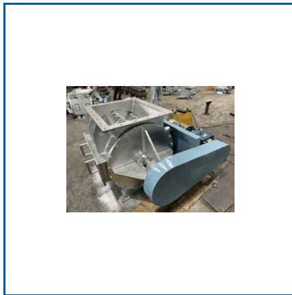
INDUSTRIAL ROTARY AIRLOCK VALVES