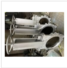
Industrial Slide Gate Valves