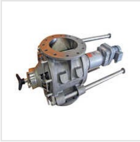
Rotech Quick Cleaning Valves