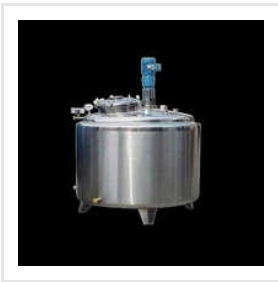
Industrial Reaction Vessels