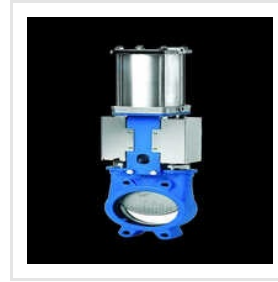
Industrial Knief Gate Valves