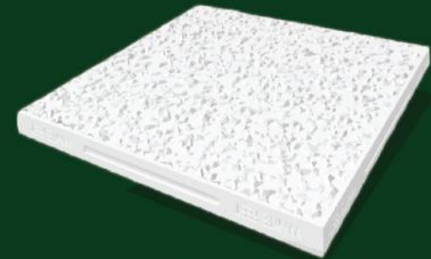
Gold - Bottom Layer