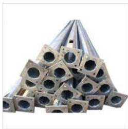
OCTAGONAL LIGHTING POLE

12.5m Highway Lighting Pole, 12m Highway Lighting Pole, 16m Highway Lighting Pole, 20m Highway Lighting Pole, 25m MS Highway Light Pole, 30m High Mast Lighting Pole, CCTV Camera Pole, CCTV Gantry Pole, Dual Arm Conical Pole, Dual Arm Steel Street Light Pole, Dual Arm Swaged Light Pole, GI Octagonal Pole, GRP Lighting Pole, Hexagonal Lighting Pole, Hot Dip GI Crash Barrier, etc.