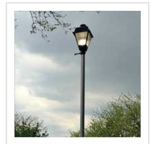
Round Lighting Pole