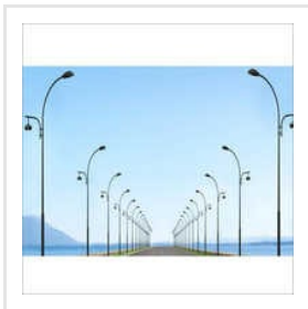
25m MS Highway Light Pole