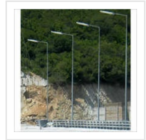
Tubular Steel Pole