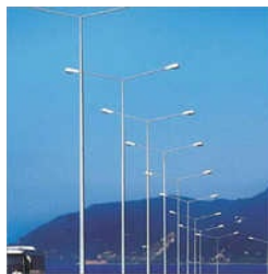
DUAL ARM CONICAL POLE