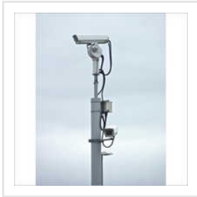
Steel CCTV Pole