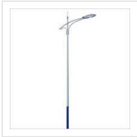
20m Highway Lighting Pole