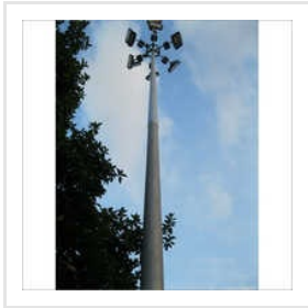
Polygonal Lighting Pole