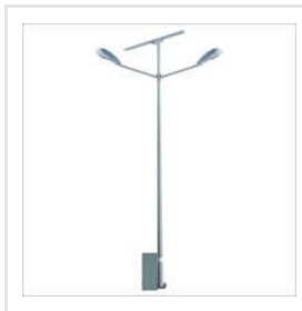
Dual Arm Steel Street Light Pole