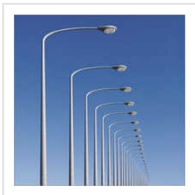
12.5m Highway Lighting Pole