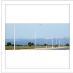
16m Highway Lighting Pole