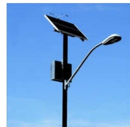
SOLAR STREET LIGHT POLE