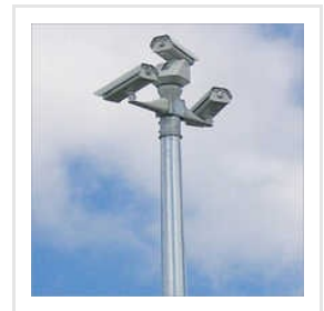
CCTV Camera Pole