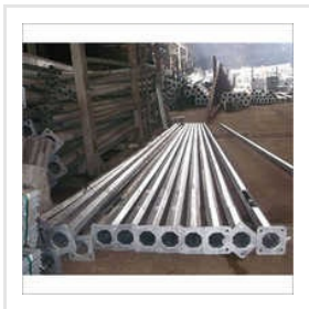
Hexagonal Lighting Pole