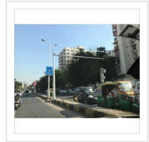
CCTV Gantry Pole