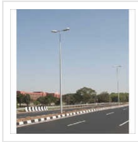
12m Highway Lighting Pole