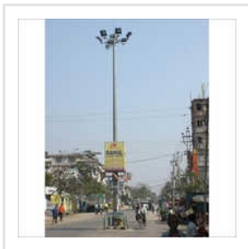
MS Lighting Tower Pole