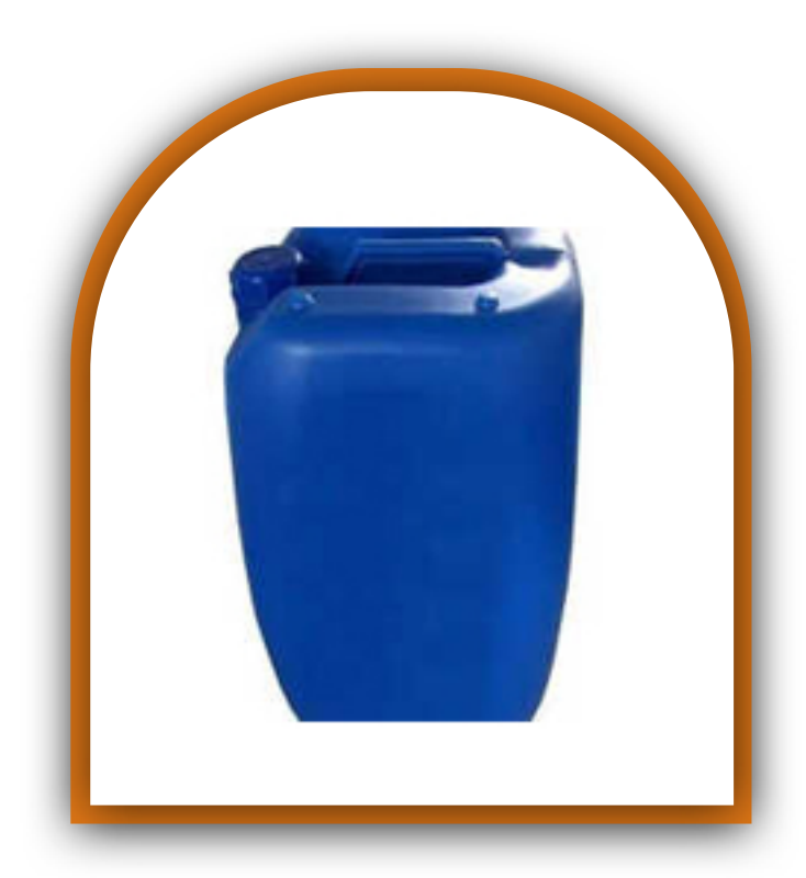
RO Water Treatment Chemical