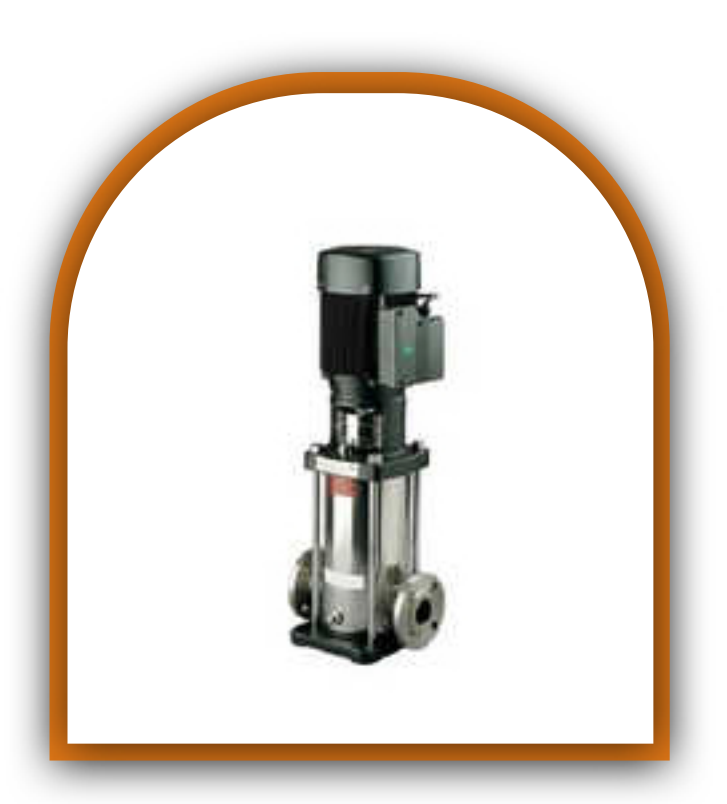
Automatic High Pressure Pump