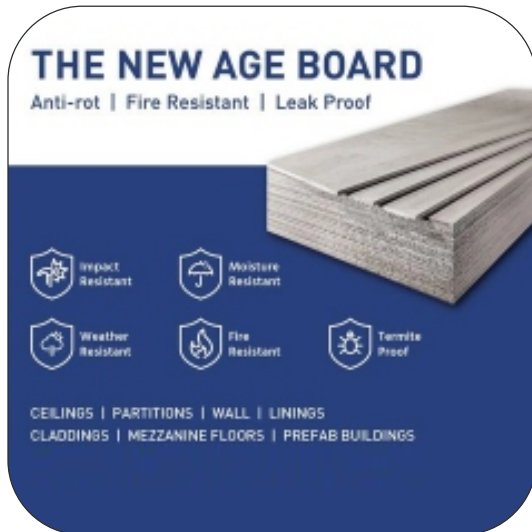
Everest Fibre Cement Board