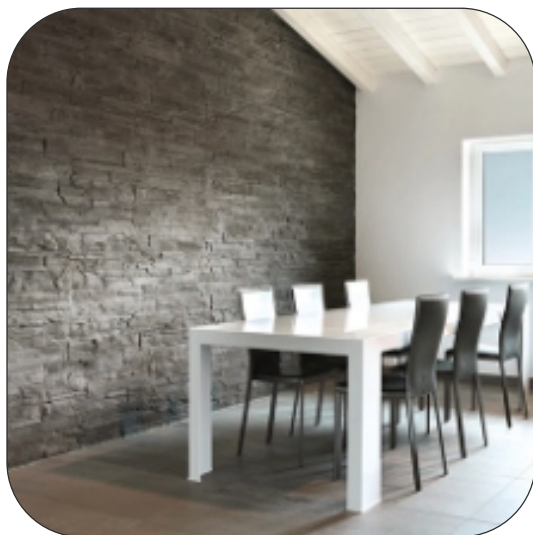
Everest Artestone Cement Stone Cladding