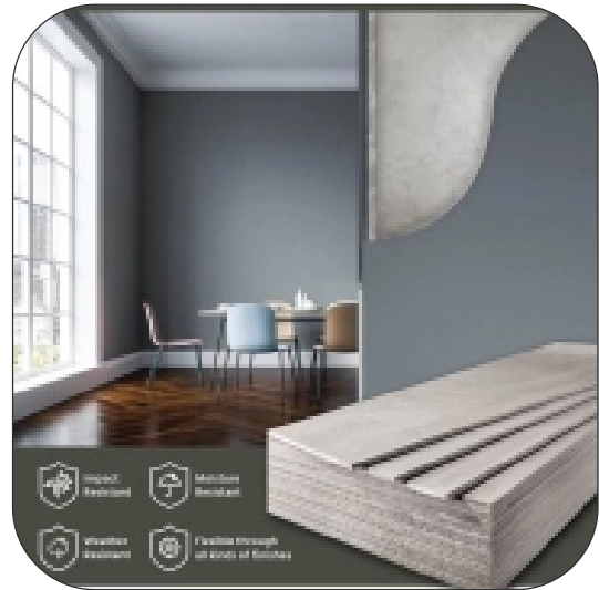
Everest Heavy Duty Board