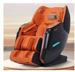
Full Body Luxury Massage Chair