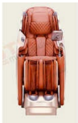
Robomax Premium Luxury Massage Chair