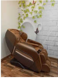
Relaxation Massage Chair