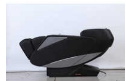
Black Zero Gravity Massage Chair