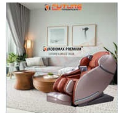
Robomax Luxury Massage Chair