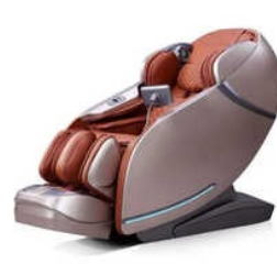
Fully Automatically Zero Gravity Massage