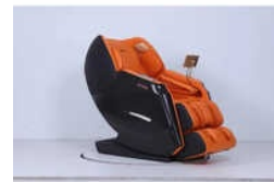
Zero Gravity Massage Chair