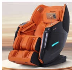
FULL BODY MASSAGE CHAIR