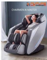
ELECTRIC MASSAGE CHAIR

4D Luxury Massage Chair, 4D Yamaha Guchi Aura Plus Full Body Massage Chair, 4d Massage Chair, Automatic Jade Massage Bed, Black Electric Massage Chair, Black Zero Gravity Massage Chair, Brown Jade Massage Bed, Chairmen Ai Master Massage Chair, Coin Vending Massage Chair, Commercial Thermal Jade Massage Bed, etc.