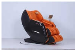
Zero Gravity Full Body Massage Chair