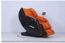
Black Electric Massage Chair