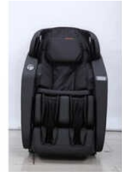
Chairmen Ai Master Massage Chair