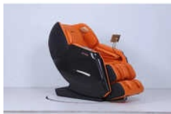
Wave Massage Chair