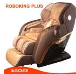
LUXURY MASSAGE CHAIR