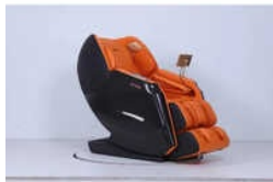
4d Massage Chair