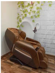
Junior Robo Queen Full Body Massage Chair