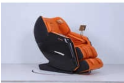
Full Body Adjustable Massage Chair