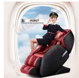
I-Robot Classic Massage Chair