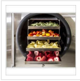
Freeze Drying Project