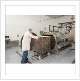
Industrial Retort Processing Services