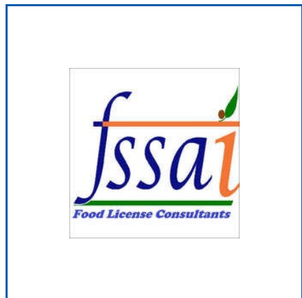
FSSAI CONSULTANT SERVICES