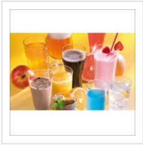
Beverages Consultant Services