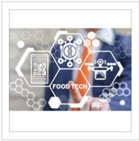
Food Industry Consultant Services