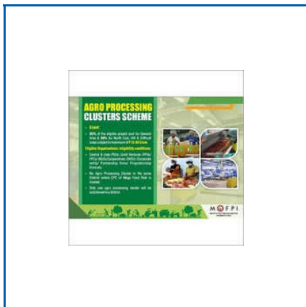
AGRO PROCESSING CONSULTANT SERVICES

Agro Processing Consultant Services, Beverages Consultant Services, Cold Chain Subsidy Consultant Services, Cookies Plant, FSSAI Consultant Services, Food Industry Consultant Services, Freeze Drying Project, Industrial Retort Processing Services, MOFPI Subsidy Consultant Services, Rusk Consultant, etc.