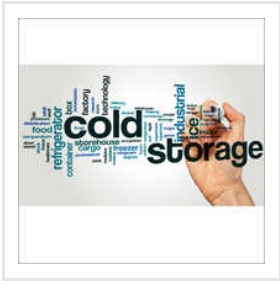
Cold Chain Subsidy Consultant Services