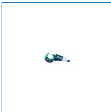
0-25MM DIGITAL OUTSIDE MICROMETER