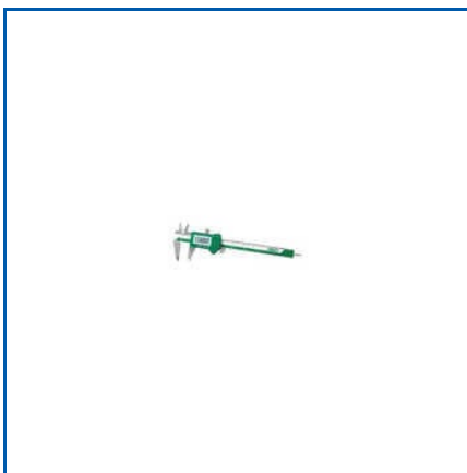
0-150MM DIGITAL VERNIER CALIPER

0-150mm Digital Vernier Caliper, 0-25mm Digital Outside Micrometer, 100 MMWC Omicron Magnehelic Gauge, 100mm Maxima Indian Desiccator, 10ml Maxima Burettes, 12 Inch Omicron Level Switch, 13N Three Phase Energy And Power Meter, 15mm Maxima Water Flow Meter, 1ml Maxima Semi Micro Beaker, 1ml Maxima Tall Form Bottle, 25mm Maxima Magnetic Flow Meter, 300kg Platform Scale, 4 Inch Dial Pressure Gauge, 400mm Maxima Laboratory Condenser Bulb, 500ml Maxima Ammonia Distilling Apparatus, etc.