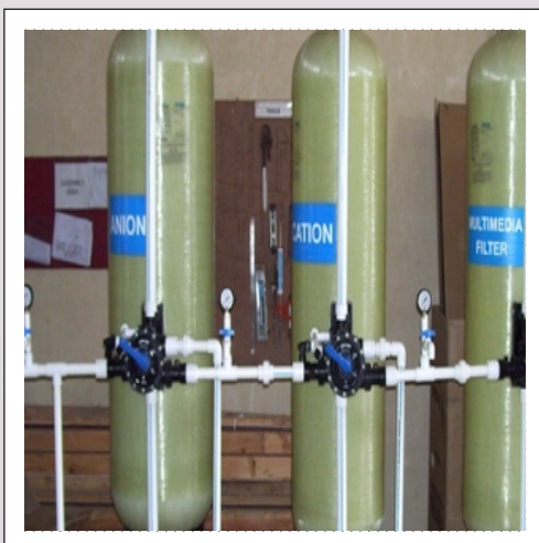
DM Water Plant