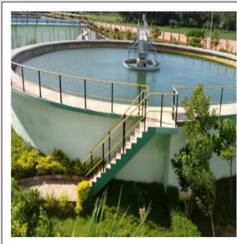
Sewage Treatment System