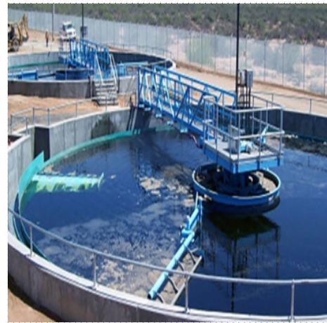
Waste Water Treatment Plant