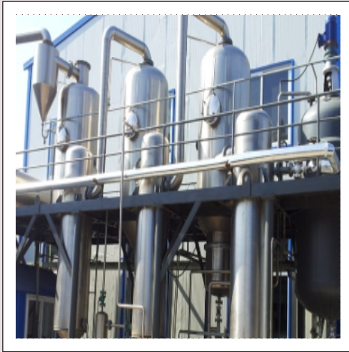
Multi Effect Evaporator