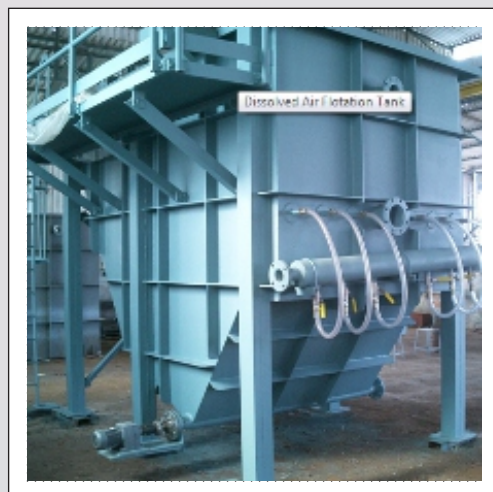
Dissolved Air Floatation Tank