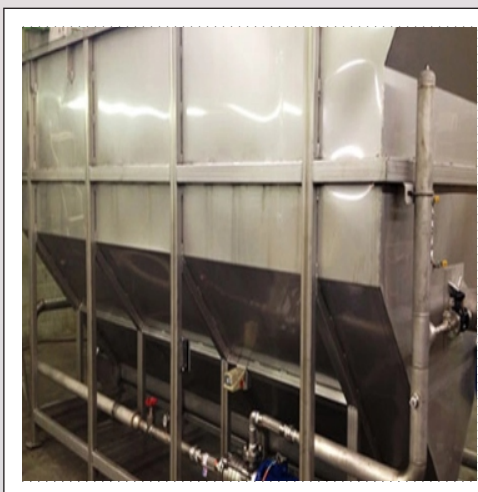
Dissolved Air Flotation