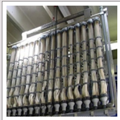
Waste Water Recycling Plant