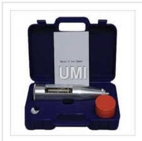
Manual Concrete Test Hammer