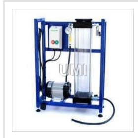
De-Airing System With Vacuum Arrangement