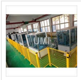
Automated Production Line Training Setup