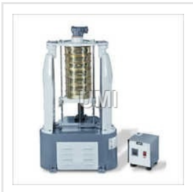
Dry Sieve Test Apparatus