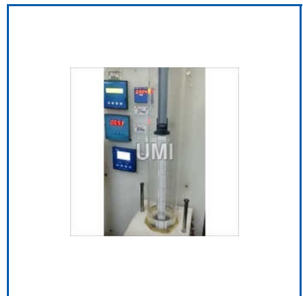
AUTO FALLING HEAD PERMEABILITY APPARATUS