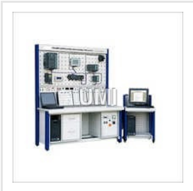
Industrial Automatic Network Integrated