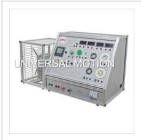
Table Top Wind Power Generation Training