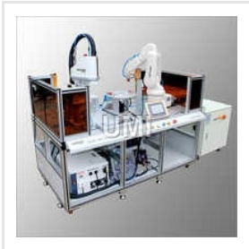
Industrial Robotic Application Training