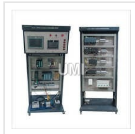
Industrial Automatic Network Integrated