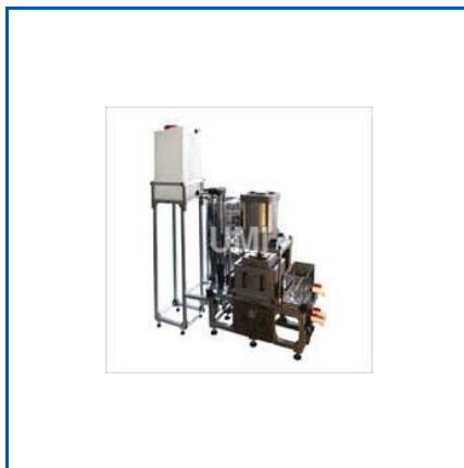
IN-PLANE WATER PERMEABILITY APPARATUS