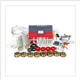
Four Cell RCPT With Temperature Sensing