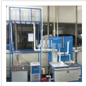
Manual Permeability Apparatus For