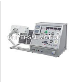
Table Top Solar Power Generation Training