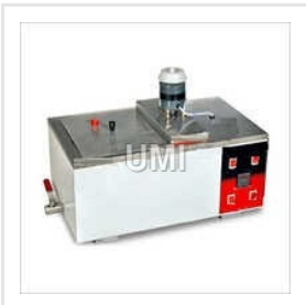
Constant Temperature Water Bath