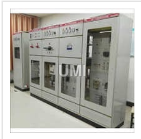
Electrical Training Equipment