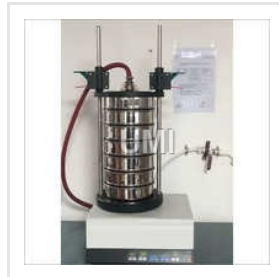
Characteristic Opening Size Apparatus