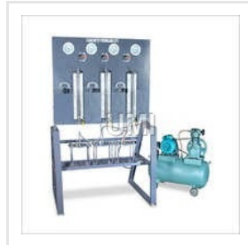
DIN-1048 6 Cell Concrete Permeability