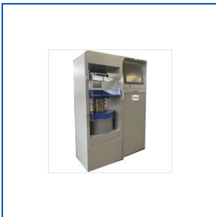
AUTOMATIC COMPRESSION TESTING MACHINE

12.7mm GripFast WEldges, Auto Falling Head Permeability Apparatus, Automated Production Line Training Setup, Automatic Compression Testing Machine, Automatic Mounting Press, Belt Grinder, Brinell Hardness Tester, Characteristic Opening Size Apparatus, Computerized 6 Pillar Universal Testing Machine Hydraulic Gripping, Constant Temperature Water Bath, DIN-1048 6 Cell Concrete Permeability Tester With Air, De-Airing System With Vaccum Arrangement, Digital Micro Vickers Hardness Tester, Digital Rockwell Hardness Tester, Digital Touch Sren Micro Hardness Tester, etc.