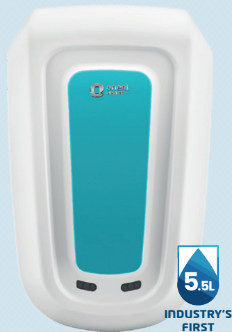
IWRP55VPS6M3-WB (5.5L, 3 kW)