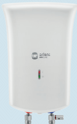
IWPM03VPS8M3-WW (3L, 3kW) IWPM03VPS8M4-WW (3L, 4.5kW)