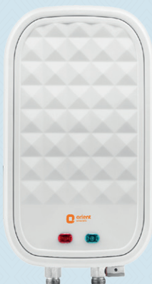
IWRV03VPS6M3-WW (3L, 3kW)