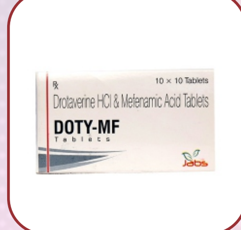
Drotaverine 80mg, Mefenamic Acid 250mg Tablets