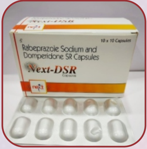
Rabeprazole Sodium & Domperidone SR Capsules