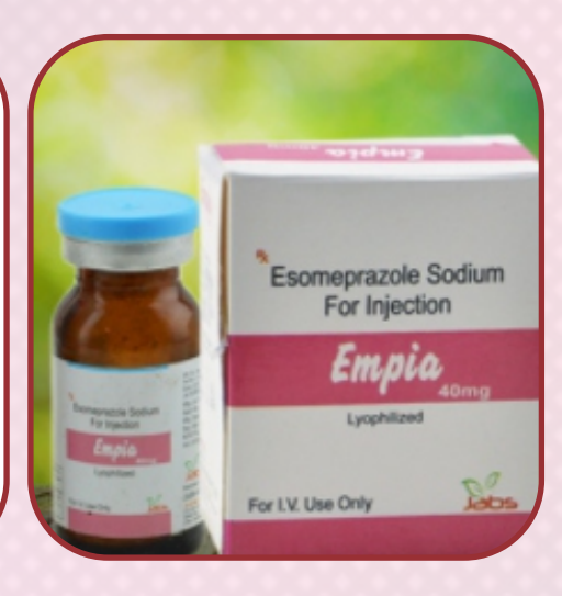
Esomeprazole Sodium Injection