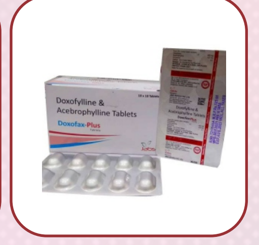
Doxofylline And Acebrophylline Tablets