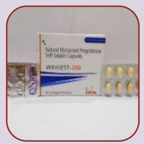
Natural Micronised Progesterone Soft Gelatin Capsules