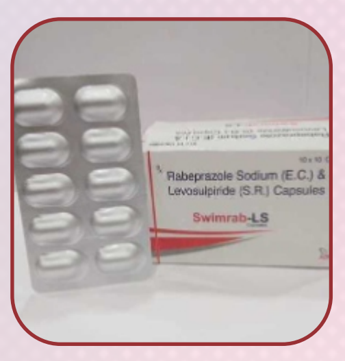
Rabeprazole Sodium (E.C) & Levosulpiride (S.R) Capsules