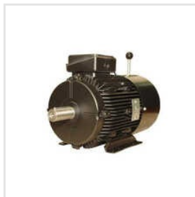
35HP Electric Motor