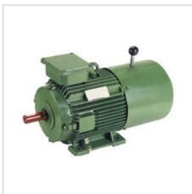
3HP Water Pump Motor