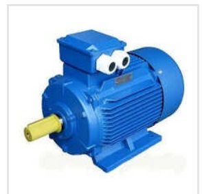
30HP AC Electric Motor