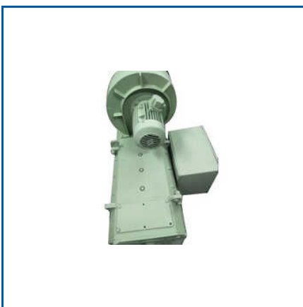
METAL ELECTRIC MOTOR