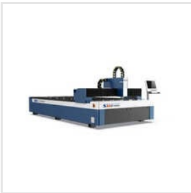
ZQ1530B Fiber Laser Metal Cutting Machine