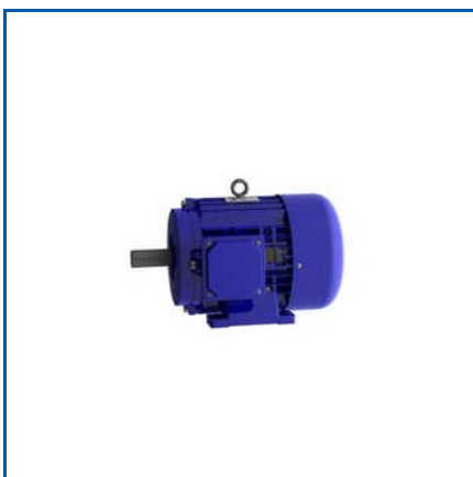
4HP THREE PHASE INDUCTION MOTOR