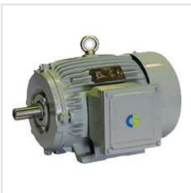
Crompton Three Phase Motor