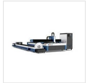
ZQ-1530BT Fiber Laser Metal Cutting Machine