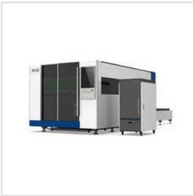
ZQ-1530E Fiber Laser Metal Cutting Machine