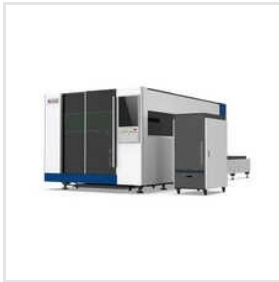
ZQ-6020T Fiber Laser Metal Cutting Machine