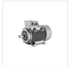
100 HP Induction Motor