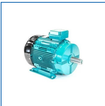
60HP ELECTRIC MOTOR

0.5HP Single Phase VFD AC Drive, 100 HP Induction Motor, 100L1-004G1-AC Drive, 100L1-1R5G1-A 220V Single Phase AC Drive, 100L1-1R5G3-A 380V Three Phase AC Drive, 100L1-2R2G1-A Three Phase AC Drive, 1HP Water Pump Motor, 2 HP Induction Motor, 220V Three Phase AC Drive, 3 Phase Electric Motor, 3 Phase Inverter Transformer, 30HP AC Electric Motor, 35HP Electric Motor, 3HP Water Pump Motor, 4HP Three Phase Induction Motor, etc.