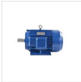
Three Phase Induction Electric Motor