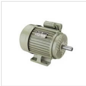
2 HP Induction Motor