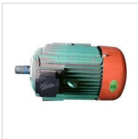
1HP Water Pump Motor