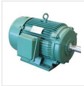
3 Phase Electric Motor