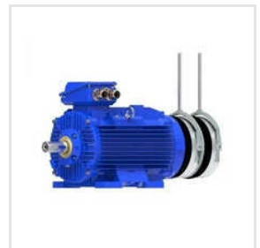
Industrial Three Phase Motor