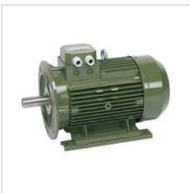
Industrial Electric Motor