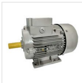
Three Phase Electric AC Motor