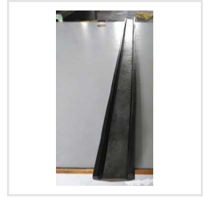
Moulded Rubber Components