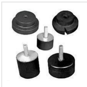
Vibration Rubber Isolators