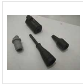
Moulded Rubber Parts