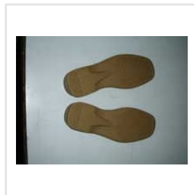
Honey Color Sole