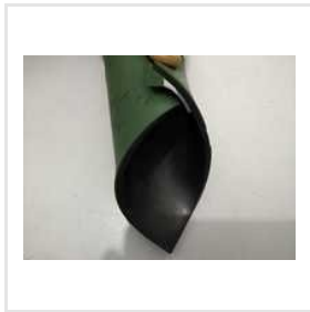
Industrial Rubber Component