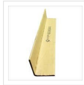
Angle Edge Board