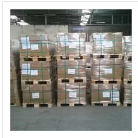
On Site Packaging Services