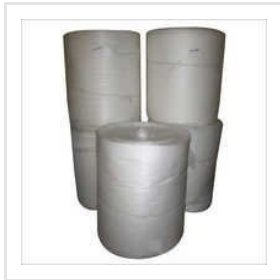
EPE Foam Roll