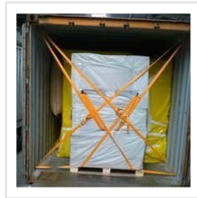
Container Packaging Services