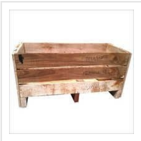
Eucalyptus Wood Box