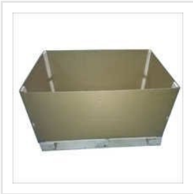
Customised CFB Box