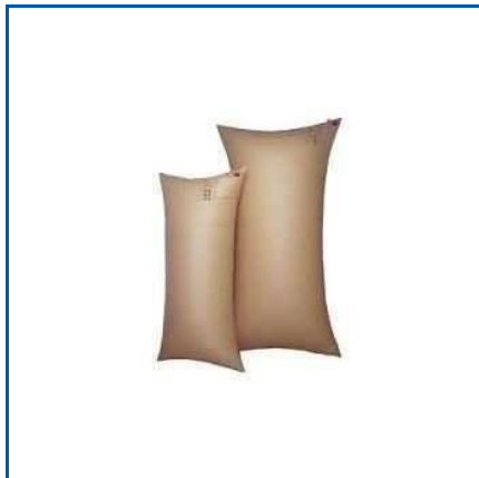
DUNNAGE AIR BAGS