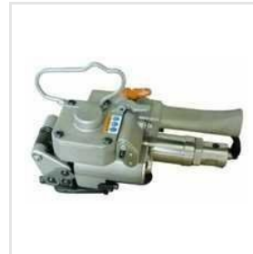
Pneumatic PET Strapping Tool