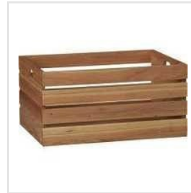
Eucalyptus Storage Boxes