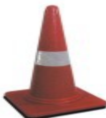
Model : TSSC-750H Height : 750mm Weight : 4.0Kg