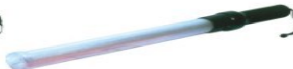
Model : TSSL-002

Safety light bar comes with Red Blinking & Red Steady function.