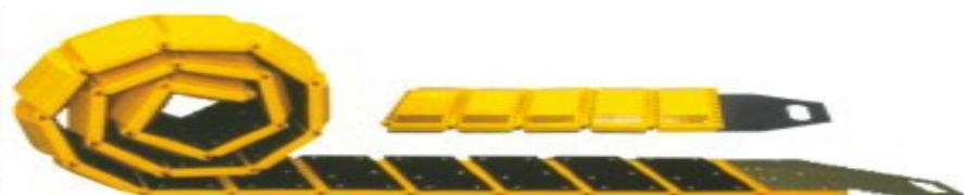
Model : TSSB-1009