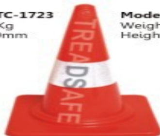
Model : TSTC-1723 Weight : 15Kg Height : 750mm