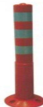
Model : TSSP-932

Dimensions Pole : 80x800mm Base : 200mm Bolt : 12x150mmx3Nos