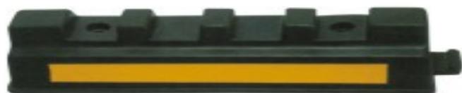
Model : TSPS-1001

Treadsafe Car Stopper helps ensure vehicles stop at the proper location while parking - preventing damage to building sidewalks, curbs and delicate landscape. Ideal for retail, commercial, business parking lots, parking garages and municipalities.