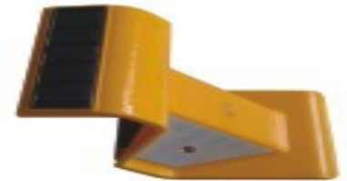
Model : TSGR-501