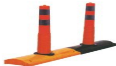
Model : TSSP-933

Dimensions Pole : 80x800mm Base : 200mm Bolt : 12x150mmx3Nos