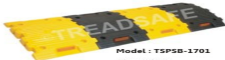
Model : TSPSB-1701

Features : • Impact Resistant • Easy to Mount • Available in Black & Yellow combination for greater visibility UV, moisture and temperature resistant • Modular design provides flexibility to suit any size of road Aesthetically Pleasing • Interlocking between each module for more • Instant and easy installation