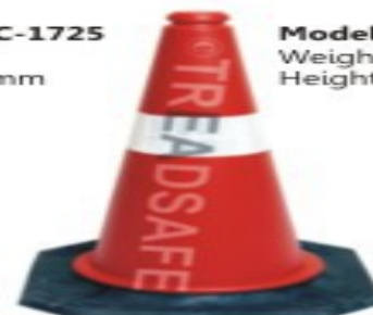
Model : TSTC-1725 Weight : 5Kg Height : 750mm