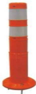
Model : TSSP-930

Dimensions Pole : 80x750mm Base : 200mm Bolt : 12x150mmx3Nos