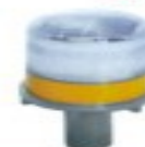
Model : TSDN-966 Aluminium alloy and Polycarbonate Size : 75 x 80 mm