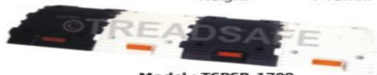
Model : TSPSB-1709

Length : 500mm Breadth : 400mm Height : 50mm