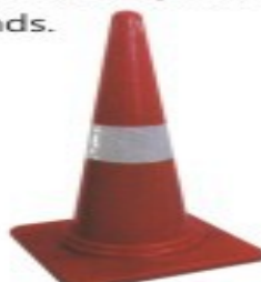
Model : TSSC-1000L Height : 1000mm Weight : 2.0Kg