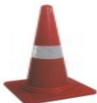
Model : TSSC-750L Height : 750mm Weight : 1.2Kg