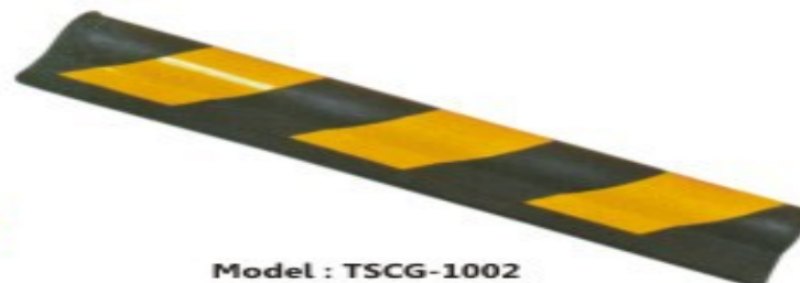
Model : TSCG-1002