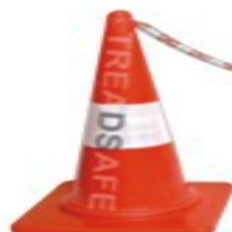
Model : TSTC-1724 Weight : 3.75Kg Height : 750mm