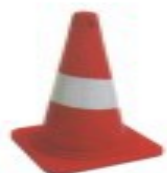
Model : TSSC-500L Height : 500mm Weight : 0.5Kg