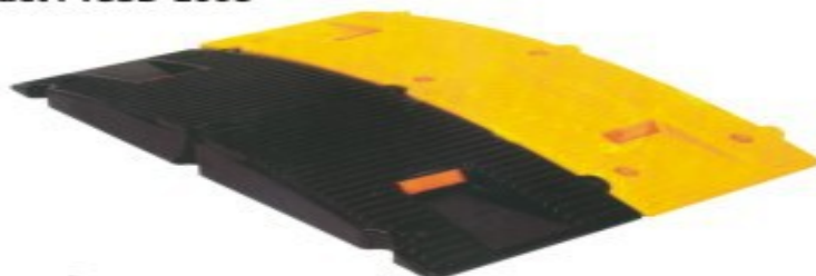
Model : TSSB-1008