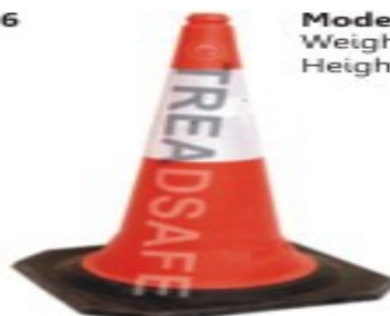
Model : TSTC-1726 Weight : 5Kg Height : 1000mm