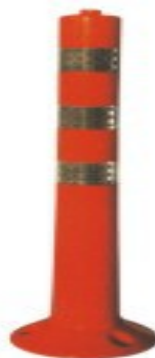
Model : TSSP-931

Dimensions Pole : 80x750mm Base : 200mm Bolt : 12x150mmx3Nos