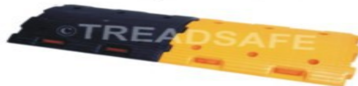
Model : TSPSB-1703

Length : 350mm Breadth : 250mm Height : 65mm