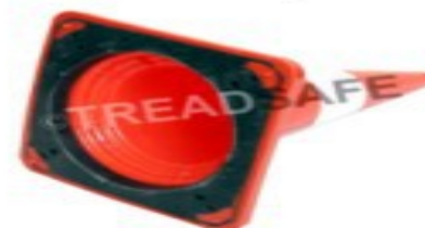
Model : TSTC-1727 Weight : 4.8Kg Height : 750mm