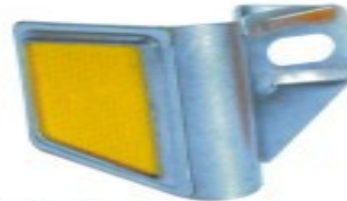
Model : TSGR-501

Treadsafe guard rail reflectors show the course of a carriageway at night. Guard rail reflectors are available for a variety of ABS plastic rail profiles. Glass reflectors retain excellent reflective properties across a number of years. This differentiates glass reflectors from other reflective materials.