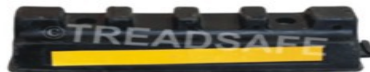
Model : TSPSB-1715

Length : 350mm Breadth : 250mm Height : 65mm