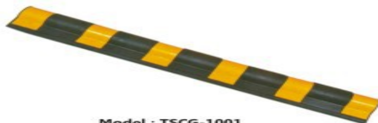
Model : TSCG-1001