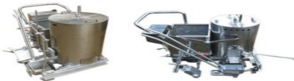
Thermoplastic Road Marking Machines

We are committed to and focused on ensuring efficient, professional, high quality service and are widely appreciated for their timely execution, weather and abrasion resistance.