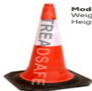
Model : TSTC-1726 Weight : 5Kg Height : 1000mm