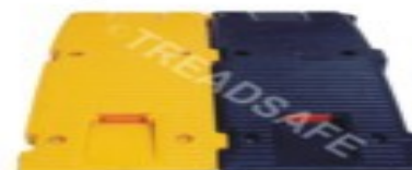
Model : TSPSB-1704