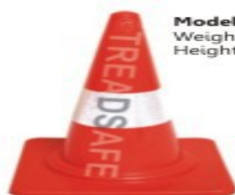
Model : TSTC-1723 Weight : 15Kg Height : 750mm

High-intensity reflective bands help make these traffic cones highly visible to approaching drivers and pedestrians in low-light conditions.