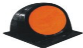
Model : TSM-100