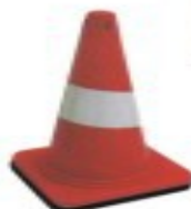
Model : TSSC-500H Height : 500mm Weight : 1.5Kg