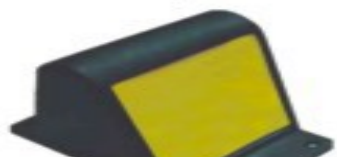
Model : TSM-200