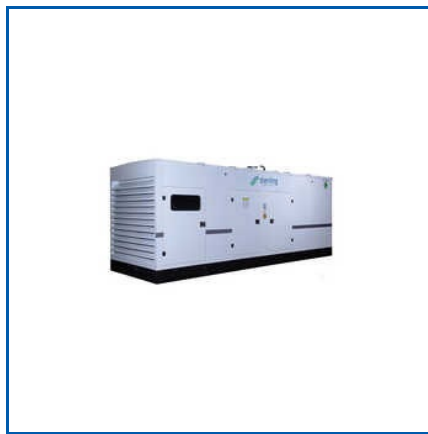
STERLING GENSET 5KVA TO 250KVA