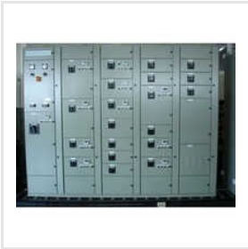
Three Phase Motor Control Panels