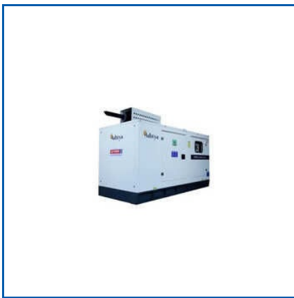
GREAVES POWER GENERATOR 40KVA

Electrical Control Panels, Greaves Industrial Generator, etc.