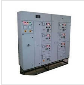
MCC Control Panel