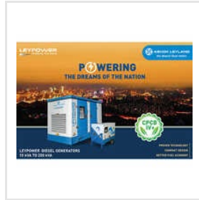
Ashok Leyland Generator 5kVA To