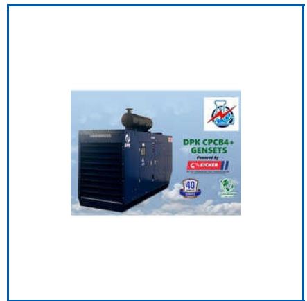
VOLVO EICHER GENERATOR 25KVA TO 160 KVA