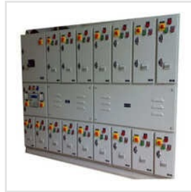
Electric Control Panel