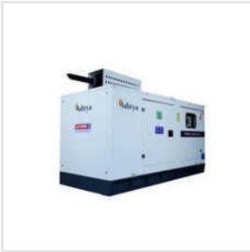
40 Kva Eicher Diesel Generator