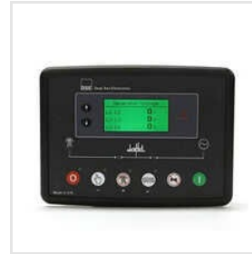
GPWII-400 Genset Controller