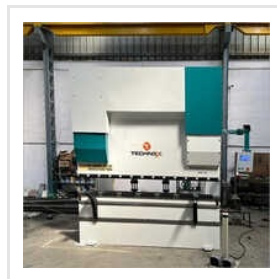
Hydraulic Plate Bending Machine