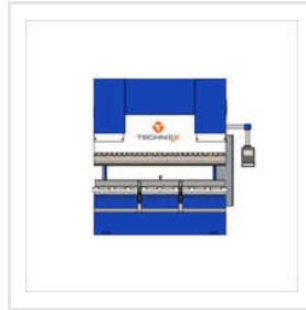
50 Ton Sheet Metal Bending Machines