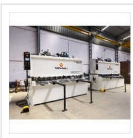
Semi-Automatic Shearing Machine