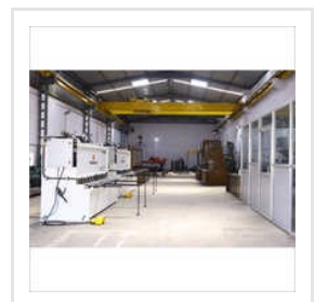
100 Ton Press Brake Machine