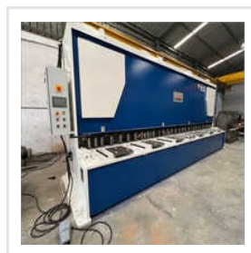
Automatic Hydraulic Plate Shearing