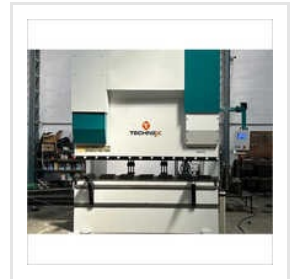
CNC Synchro Press Brake Machine