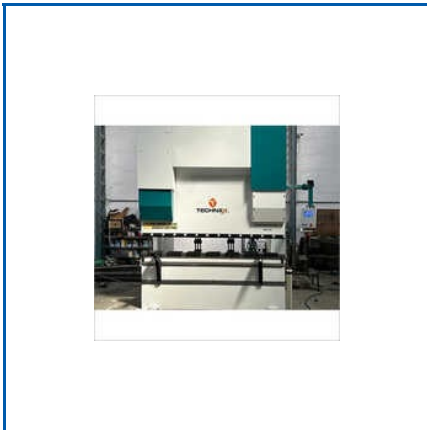
INDUSTRIAL CNC SYNCRO PRESS

100 Ton Press Brake Machine, 150 Ton Automatic Hydraulic Sheet Shearing Machine, 150 Ton Hydraulic Plate Bending Machine, 150 Ton Hydraulic Press Brake Machine, 20 Ton to 700 Ton Sheet Metal Press Brake Machine, 240 V NC Hydraulic Press Brake Machine, etc.