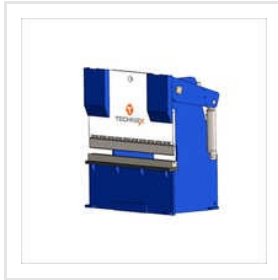
20 Ton To 700 Ton Sheet Metal Press