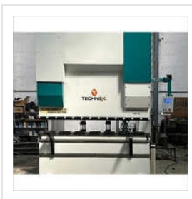
450 Ton CNC Plate Bending