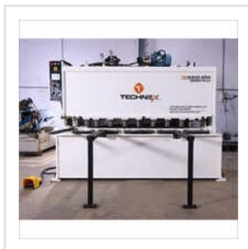
150 Ton Automatic Hydraulic Sheet