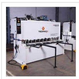
Hydraulic Guillotine Shearing Machine