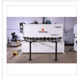
Power Shearing Machine