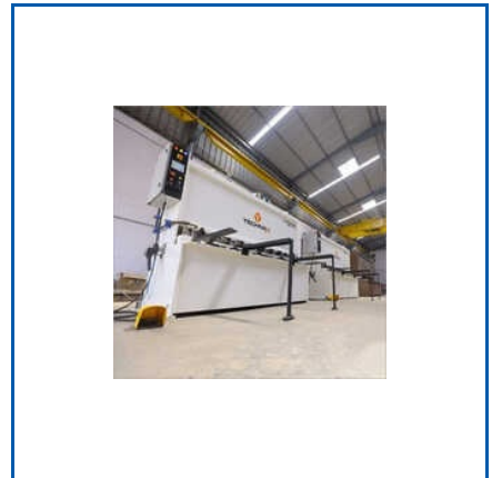
50 TON METAL SHEET PRESS BRAKE