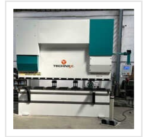
500 Ton CNC Metal Bending Machine