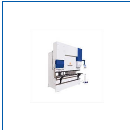
CNC PRESS BRAKE MACHINE