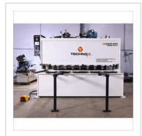
Electrical Power Shearing Machine