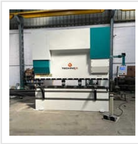
150 Ton Hydraulic Press Brake Machine