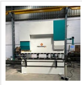
240 V NC Hydraulic Press Brake Machine