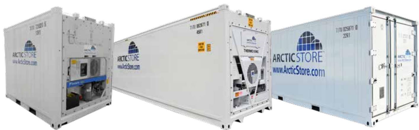
Our market leader range of 10ft, 20ft & 40ft ArcticStores.

sufficient to realise acceptable temperature reduction (removal of field heat) of fresh produce. When storing fruit and vegetables the fresh air exchange valve can be activated to remove the harmful gases. Smaller quantities of products can also be deep frozen in 12-24 hours. We have special models with increased effect for this function. Average power consumption is 2 kWh in 32C ambient temperature.