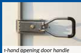
1-hand opening door handle