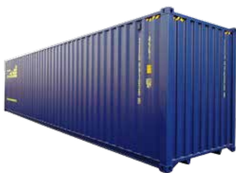
40ft ISO shipping or storage container

■ WE OPERATE THE FULL RANGE OF CONTAINERS INCLUDING SOME MODELS NOT GENERALLY AVAILABLE