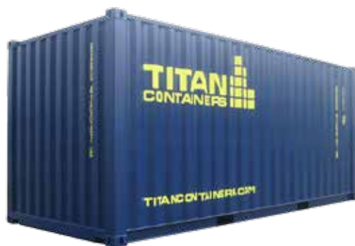
20ft ISO container