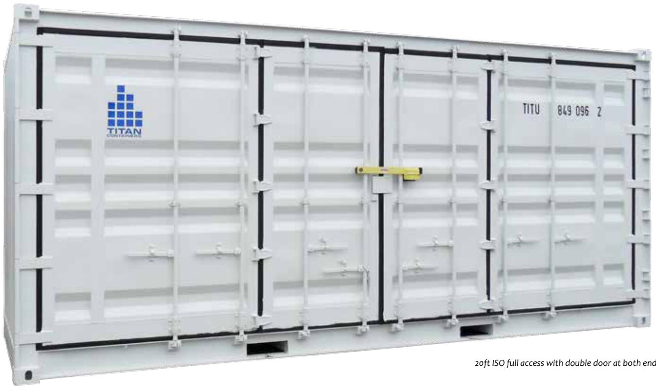
20ft ISO full access with double door at both ends

All types are available for hire or sale as new containers. Many types are also available in used and refurbished condition. Naturally all are supplied with valid CSC plates. Containers can be supplied from India with return acceptable in many parts of the world. Similarly we can supply outside of India with return at Indian or other worldwide locations. Domestic use containers for DTA logistics and storage applications are also available. Long & short (spot) term hire as well as 1-way rental terms are offered. For offshore containers please see the next pages about DNV Containers.