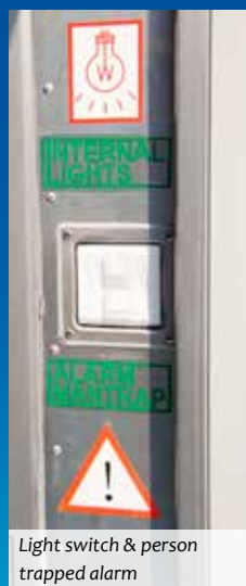
Light switch & person trapped alarm