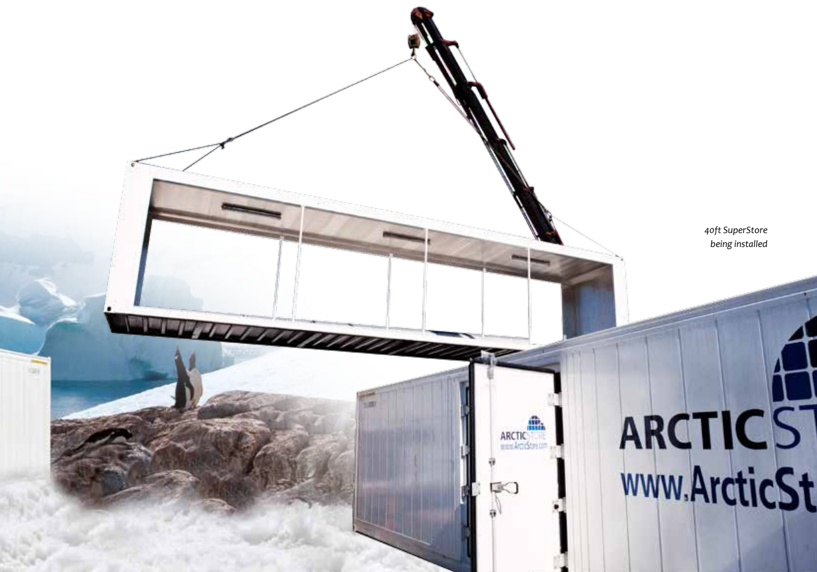
40ft SuperStore being installed