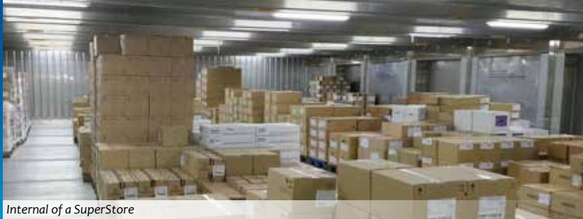
Internal of a SuperStore