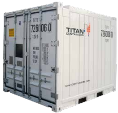
10ft 2.7-1 DNV offshore reefer container

We operate the full range of dry van and dry special containers including some models not generally available. Available size/types include: