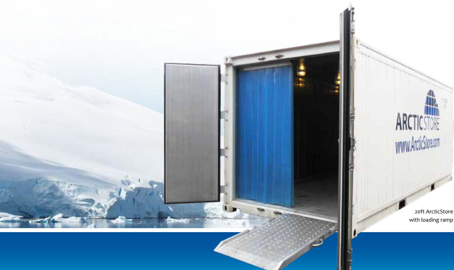
20ft ArcticStore with loading ramp

Dimensions shown are typical and variances are possible.