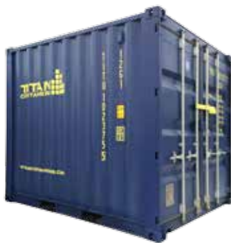
10ft ISO container