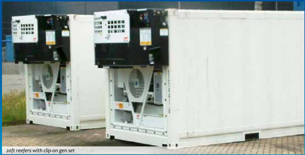
20ft reefers with clip-on gen set