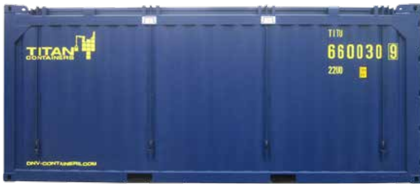
20ft 2.7-1 DNV offshore hard top dry container