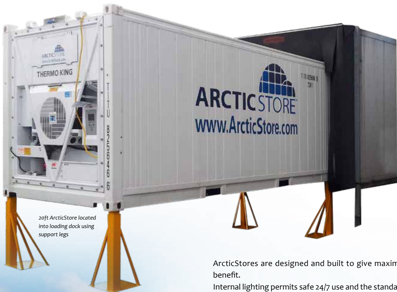
20ft ArcticStore located into loading dock using support legs

■ SOPHISTICATED EASY TO USE, EXTREMELY RELIABLE & POWER EFFICIENT