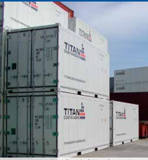
20ft stack of ISO reefer containers