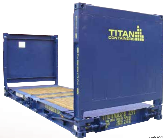
20ft ISO collapsible flatrack

All types are available for hire or sale as new containers. Many types are also available in used and refurbished condition. Naturally all are supplied with valid CSC plates. Containers can be supplied from India with return acceptable in many parts of the world. Similarly we can supply outside of India with return at Indian or other worldwide locations. Domestic use containers for DTA logistics and storage applications are also available. Long & short (spot) term hire as well as 1-way rental terms are offered. For offshore containers please see the next pages about DNV Containers.