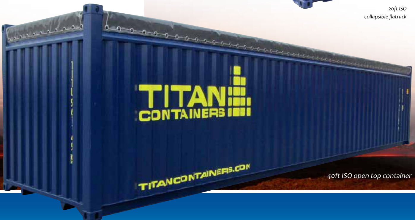
40ft ISO open top container