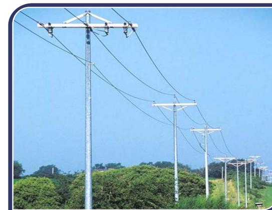
Electrical Poles (Actual Site)