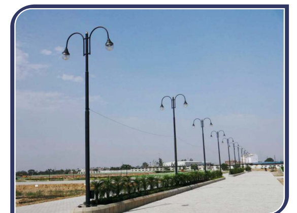
Decorative Poles (Actual Site)