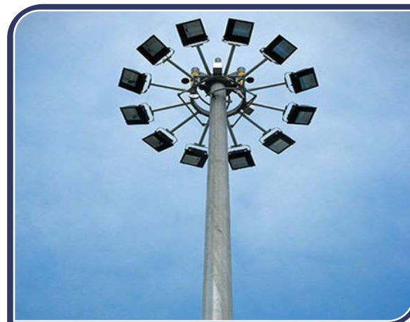
High Mast Poles (Actual Site)