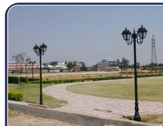
Decorative Poles (Actual Site)