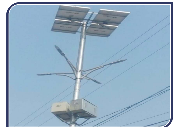
Solar Poles (Actual Site)