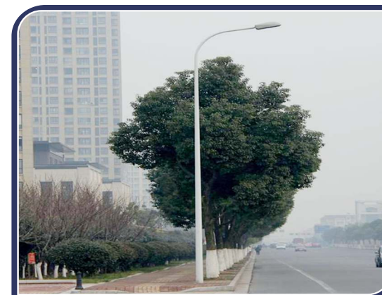
Street Light Tubular Poles (Actual Site)