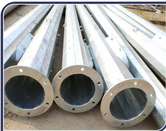
High Mast Poles (Plant)