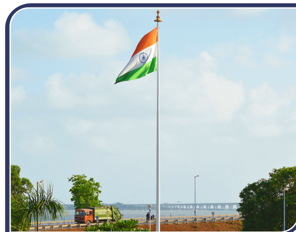
Flag Mast Poles (Actual Site)