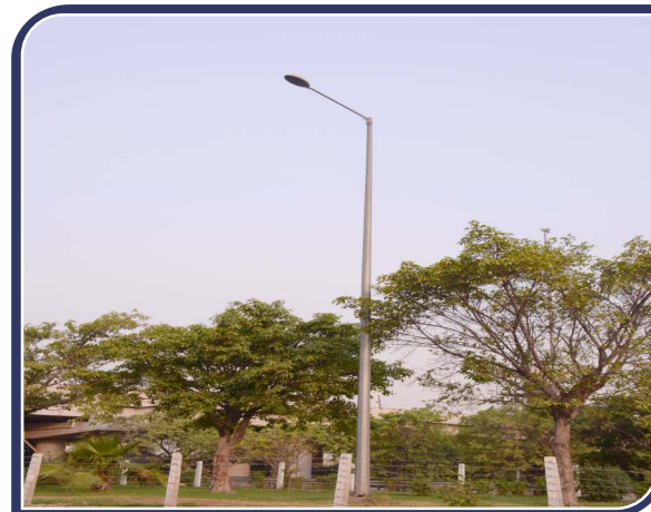
Octagonal Poles (Actual Site)