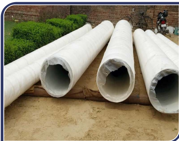
Flag Mast Poles (Plant)