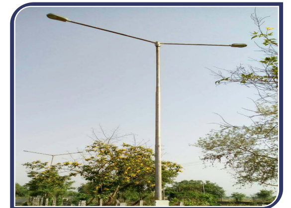
Tubular Poles (Actual Site)