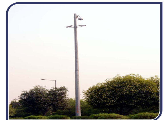
Security Camera Poles (Actual Site)