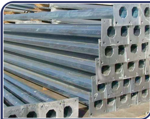
Octagonal Poles (Plant)

We take pleasure and pride to introduce ourselves as a leading manufacturer under KASPER LIGHTING SYSTEM described below. We are ISO 9001:2015 Certified Company which provides solutions of your lighting needs.