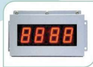
Digital Display Unit