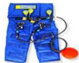
Anti Shock Trousers Jacob