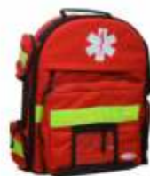
Code Blue Bag