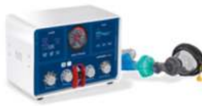
Transport Ventilator (Spencer 190)