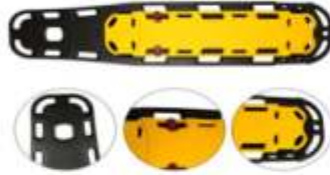
Spine Board Combo Imported