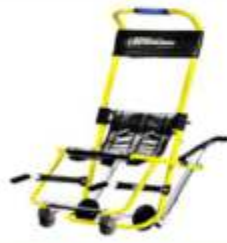
Evacuation Chair - Pro Skid E