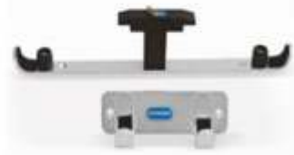
10G vertical Fixation For Scoop Stretcher