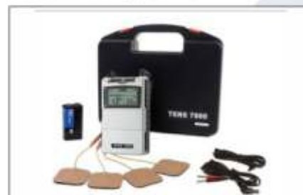
V2U TENS D1 7000

Dynamic Compression Therapy has been clinically proven to significantly improve healing time in the treatment.