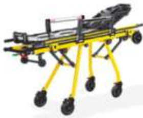
Cross Ambulance Stretcher