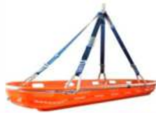
Basket Stretcher with Rigging