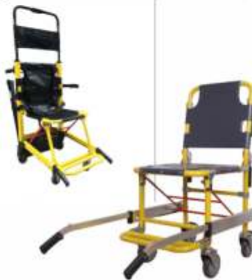
Wheel Chair Cum Stair Chair (imp)