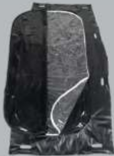
Dead body bag - Cadaver bags