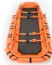
Basket Stretcher with Flotation