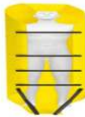
Total Recovery Stretcher