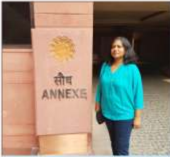
The Parliament of India