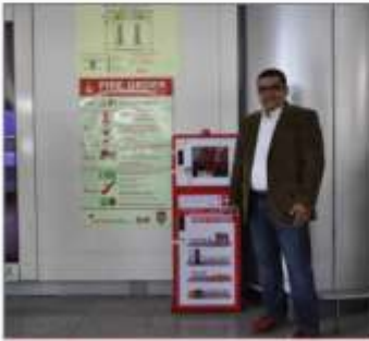
Rajiv Gandhi Hyderabad International Airport