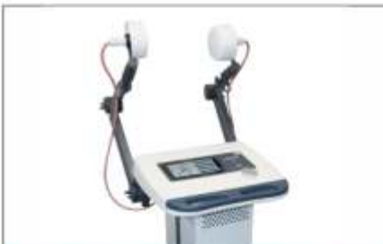
Megapulse Senior 265

The SoLo Laser 755 has two sockets for single or cluster probes ensuring quick and easy treatments. It is supplied mains only as standard.