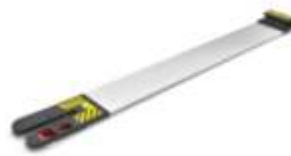
S Max 10G Fixation for Auto-Loading