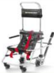
Evacuation Chair - Skid OK