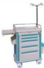
Emergency Crash Cart