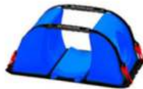
Head immobilizer - Super blue