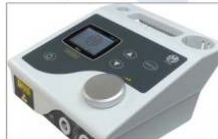
SoLo Laser 755

The Vacuum 660 works in combination with any EMS Physio stimulation unit (ie EMS960, EMS970 and EMS860 to provide easy application of electrodes during treatment.