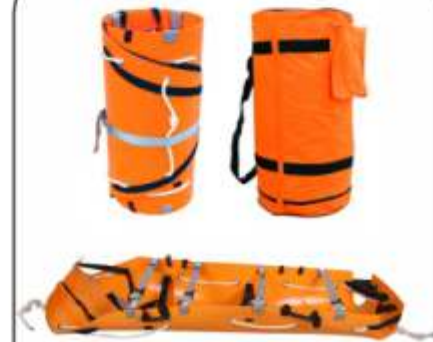
Multi-Functional Rescue Stretcher