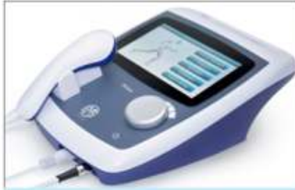
Primo Combination 860

The Primo Therasonic has been designed to offer you a wide range of choices for your ultrasound.