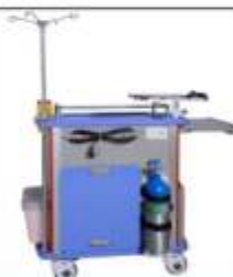
Emergency Crash Cart