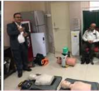
SVP National Police Academy