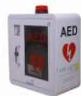
Alarmed AED Cabinet