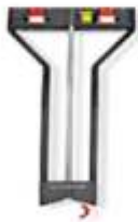
R-Max 10G Fixation for Auto-Loading Stretcher