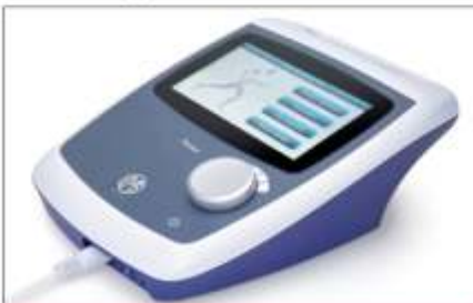
Primo Multidyne 970

The Primo Interferential 960 uses a mid-frequency electrical signal to treat muscular spasms