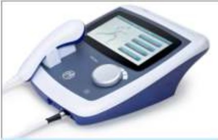
Primo Therasonic 360 and 460

The Primo Therasonic has been designed to offer you a wide range of choices for your ultrasound.