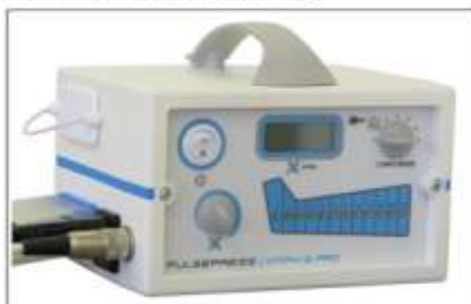
Lymph 12 Pro

Friction free rolling top traction table, it is ideal for both lumbar and cervical traction.