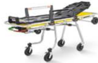
Carrera Pro Ambulance Stretcher