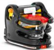
Suction Apparatus Ambujet