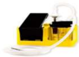
Manual Foot Suction Pump RES Q VAC