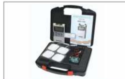
V2U NMES D1 7500

The NeuroTrac Simplex is an advanced and simple to use single channel EMG biofeedback unit, featuring.