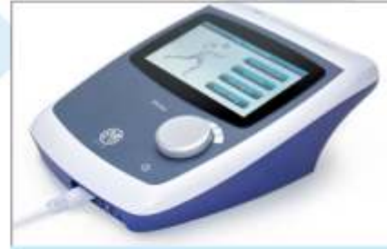
Primo Interferential 960

The Primo Combination 860 offers dual frequency ultrasound (1 MHz and 3 MHz)