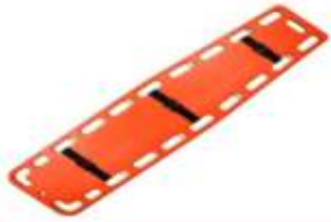
Spine Board Long - Indian