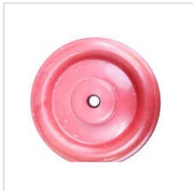
High Grade PPCP Trolley Wheels