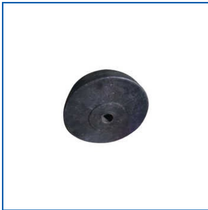
PP CO POLYMER WHEELS

Black Polymer I Type Wheel, Heavy Caster Wheel, Heavy Duty PU Caster Wheels, High Grade PPCP Trolley Wheels, High Grade Polypropylene Wheels, High Quality Polymer Wheel, High Quality Trolley Caster Wheels, etc.