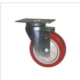
Polyurethane Caster Wheels