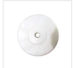
PPCP Trolley Wheels