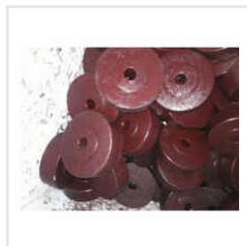
Polymer Solid Wheel