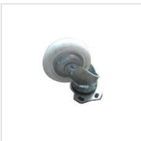
Heavy Caster Wheel