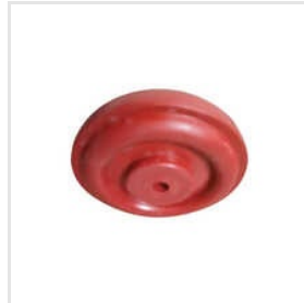
Ppcp Red Wheel