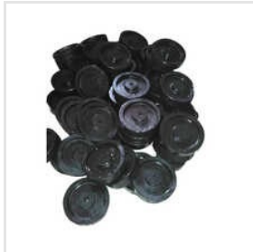
Black Polymer I Type Wheel