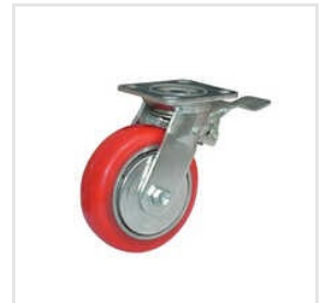
Heavy Duty PU Caster Wheels