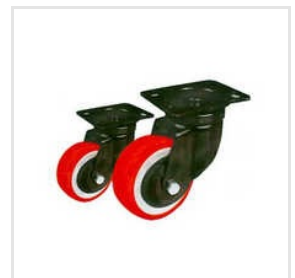
PU Caster Wheel