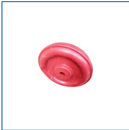
POLYPROPYLENE CO POLYMER WHEELS