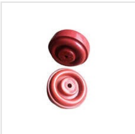
PPCP Red Round Caster Wheel