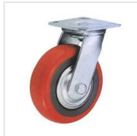
Red Caster Wheels