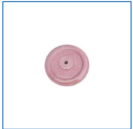
HIGH QUALITY POLYMER WHEEL