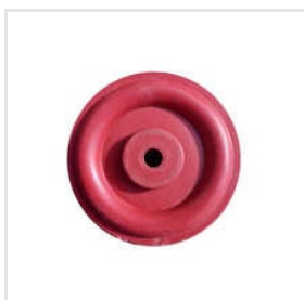
PPCP Round Trolley Wheel