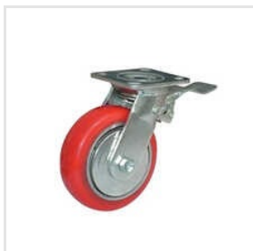
PP Caster Wheels